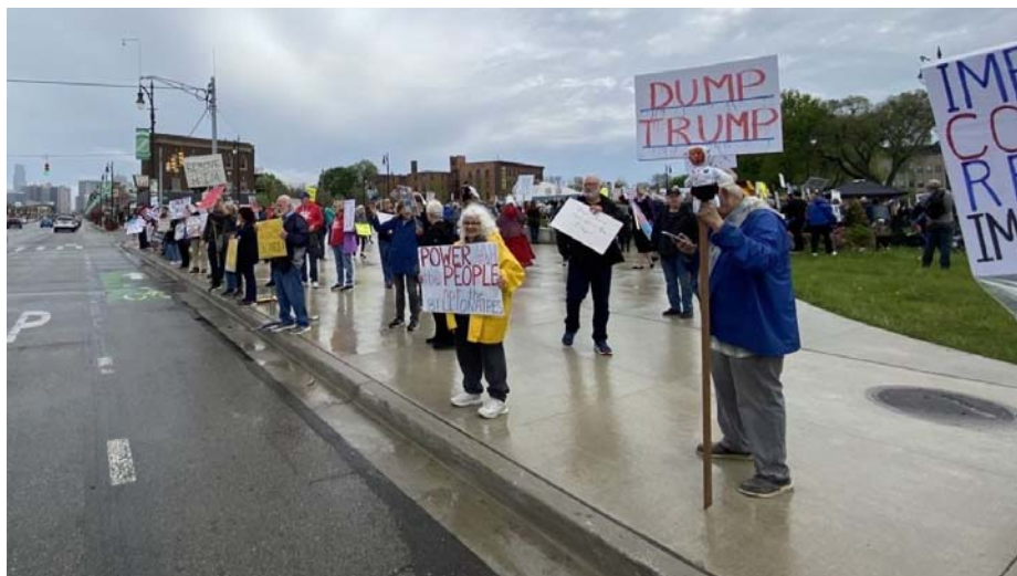
Crowd at Detroit May Day protest

“Over the last 50 years, the very richest people in this country have become much richer, while 800,000 people today sleep out on the street and the average worker struggles,” he declared. Sanders did not mention that it was the Biden administration, whom he had campaigned for and praised, which allowed billionaire wealth to increase by over a trillion dollars in 2024 . This happened while homelessness doubled during his administration.