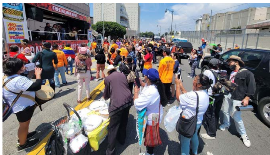
A section of the May Day rally in Los Angeles, California, May 1, 2025.

"Then you have Biden, another mess, and now you have this fascist who is essentially implementing, intensifying, and bringing to a new level all of the measures that had already been implemented," they said. Summing up the experience over the past years of social and political reaction, the protester stated "It's like enough is enough."