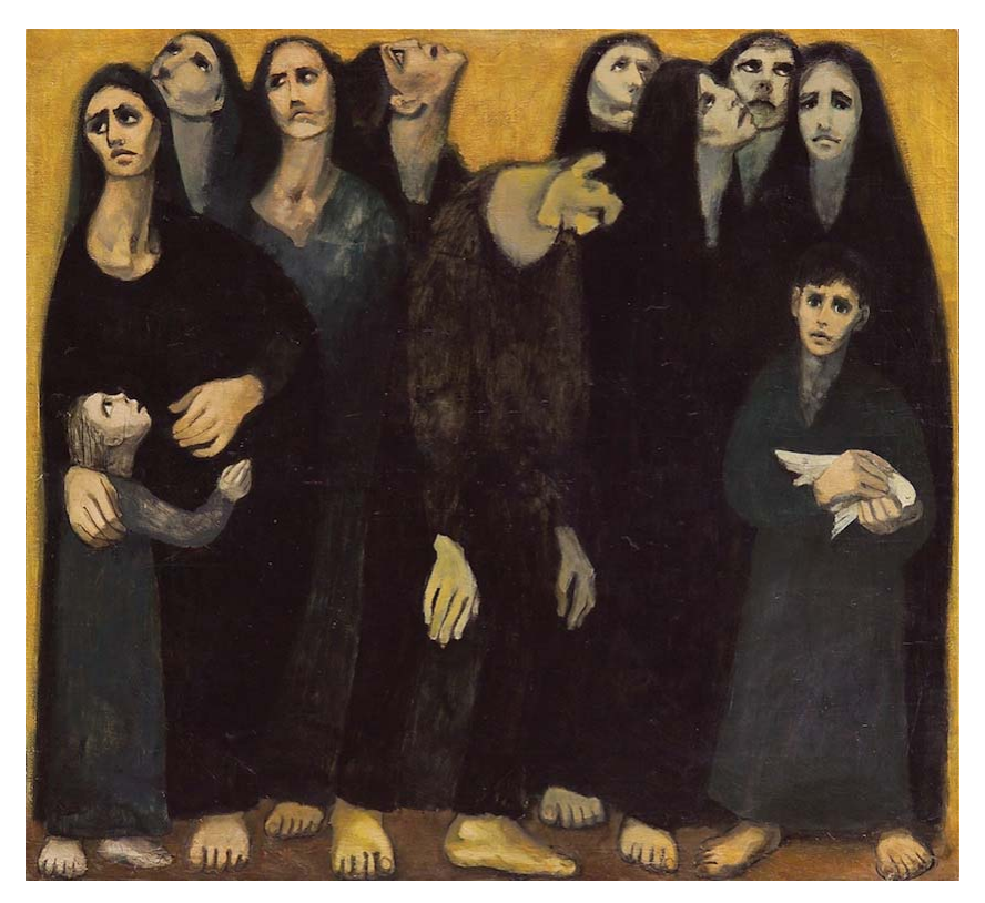
Louay Kayyali (Syria), Then What?, 1965.

Russia has been anxious about its security guarantees ever since the United States began to unilaterally withdraw from the delicate arms control system. The bookends of this dismissal are the US's 2001 departure from the 1972 Anti-Ballistic Missile Treaty and 2019 revocation of the 1987 Intermediate-Range Nuclear Forces Treaty. The disposal of these treaties and the failure to acknowledge Russian pleas for security guarantees – alongside NATO aggressions in Yugoslavia, Afghanistan, and Libya – caused anxieties to grow in Moscow about the possibility that the West could place short-range nuclear missiles in Ukraine or in the Baltic states and be able to strike large Russian cities in the west without any hope of defence. That has been Russia's main argument with the West. If the West had taken the treaties that Russia proposed in December 2021 seriously, then we might not be in a situation where the Western countries are discussing the use of NATO missiles against Russia.