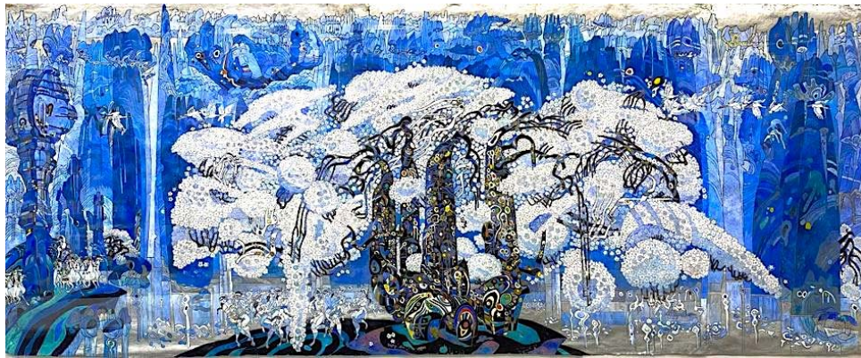
Jiang Tiefeng, China, “Stone Forest,” 1979.

These instruments would include sanctions and diplomatic threats, all of which would dampen the confidence of governments that have weaker political commitments and are not backed by popular movements committed to a new world order.