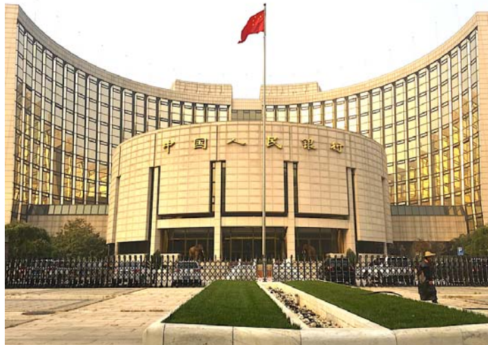
The People’s Bank of China in Beijing.

RMB internationalisation, Yu argues, “is a goal worth pursuing,” but it is not something that can take place in the short run. “Distant water,” he writes poetically, “will not quench immediate thirst.”