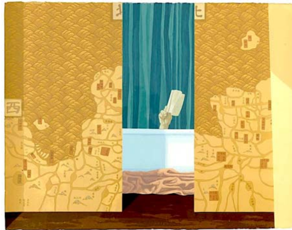
Xu Lei, China, “Map of the Mountains and Seas,” 2003.

The invitation extended to six countries to join the BRICS bloc last August was a further indication that such a shift is underway. Among these countries are Iran, Saudi Arabia and the U.A.E., although Saudi Arabia has yet to finalise its membership.