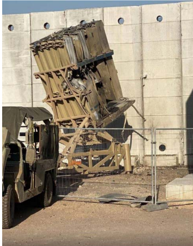
An Iron Dome batter targeted by Hezbollah

This comes as over 200,000 settlers in the north are displaced by the resistance, having built their own refugee camp . Some want to secede from "Israel" and build their own state , while others, such as the settlement of "Margalioth" have severed their ties with the entity as of yesterday.