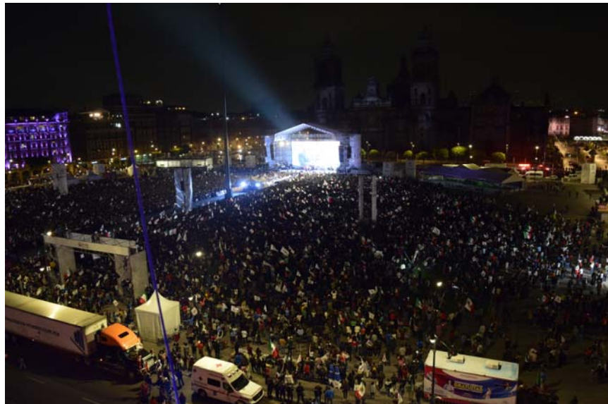
Celebration of Andrés Manuel López Obrador’s July 1, 2018, election victory, Zocalo, Mexico City.