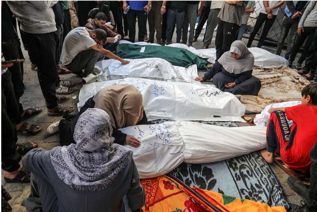
Palestinians wait to receive the bodies of their relatives who were killed in Israeli airstrikes, at Al-Najjar Hospital in Rafah, southern Gaza Strip, November 7, 2023.