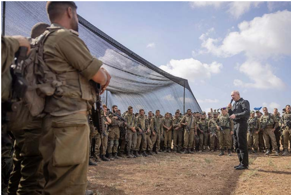
Defence Minister Yoav Gallant speaks with Israeli soldiers at a staging area not far from the Gaza fence, October 19, 2023.