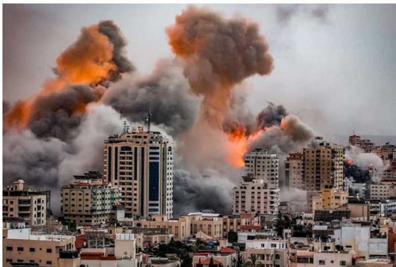
A ball of fire and smoke rises during Israeli airstrikes in the Gaza Strip, October 9, 2023.

“In the bombing of the commander of the Shuja'iya Battalion, we knew that we would kill over 100 civilians,” B. recalled of a Dec. 2 bombing that the IDF Spokesperson said was aimed at assassinating Wisam Farhat. “For me, psychologically, it was unusual. Over 100 civilians — it crosses some red line.”