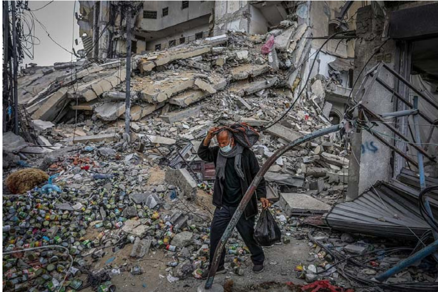
Palestinians at the site of a building destroyed by an Israeli airstrike in Rafah, in the southern Gaza Strip, March 18, 2024.

One source who worked with the military data science team that trained Lavender said that data collected from employees of the Hamas-run Internal Security Ministry, whom he does not consider to be militants, was also fed into the machine. “I was bothered by the fact that when Lavender was trained, they used the term ‘ Hamas operative ’ loosely, and included people who were civil defense workers in the training dataset,” he said.