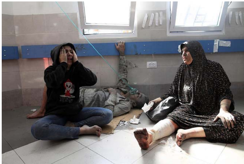
Wounded Palestinians are treated on the floor due to overcrowding at Al-Shifa Hospital, Gaza City, central Gaza Strip, October 18, 2023.

“In the end it was everyone [marked by Lavender],” one source explained. “Tens of thousands. This happened a few weeks later, when the [Israeli] brigades entered Gaza, and there were already fewer uninvolved people [i.e. civilians] in the northern areas.” According to this source, even some minors were marked by Lavender as targets for bombing. “Normally, operatives are over the age of 17, but that was not a condition.”