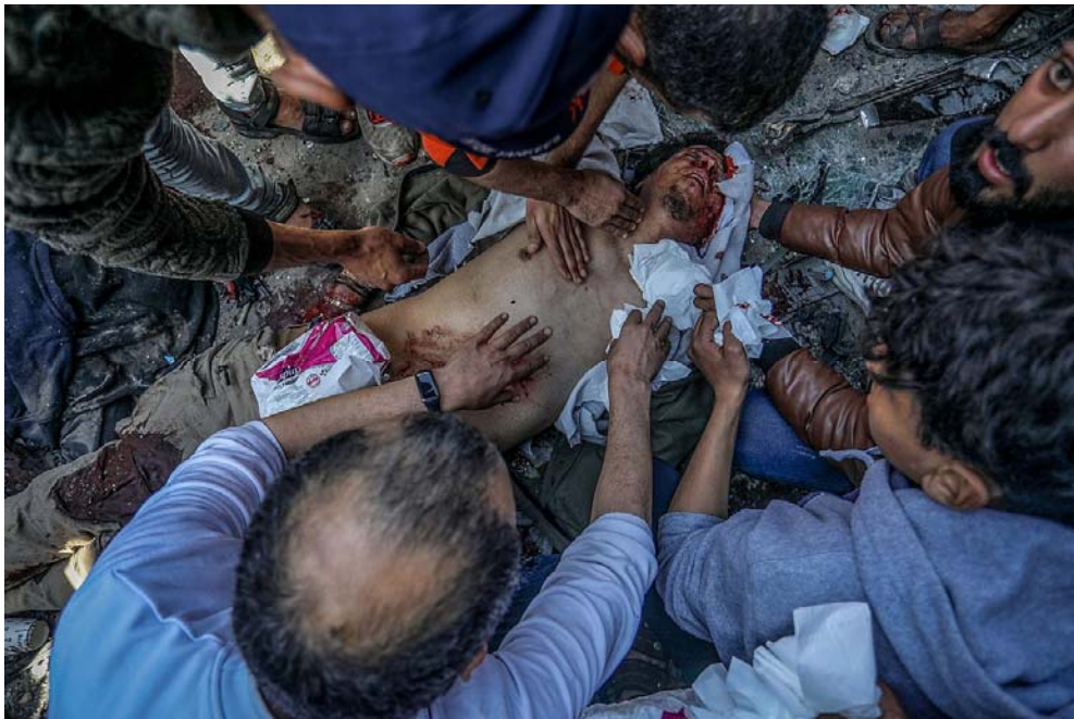
Palestinians at the site of an Israeli airstrike in Rafah, in the southern Gaza Strip, February 24, 2024.

“How close does a person have to be to Hamas to be [considered by an AI machine to be] affiliated with the organization?” said one source critical of Lavender’s inaccuracy. “It’s a vague boundary. Is a person who doesn’t receive a salary from Hamas, but helps them with all sorts of things, a Hamas operative? Is someone who was in Hamas in the past, but is no longer there today, a Hamas operative? Each of these features — characteristics that a machine would flag as suspicious — is inaccurate.”