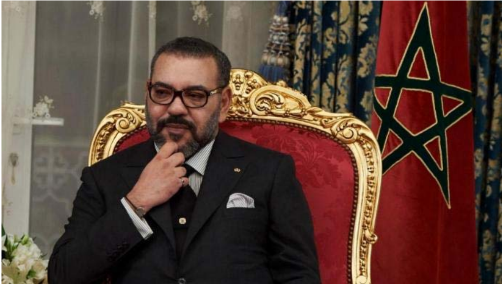
Moroccan King Mohammed

In a controversial, circuitous and secret ballot, in January, 2024 Omar Zniber from Morocco gained the position of president of the United Nations Human Rights Council.