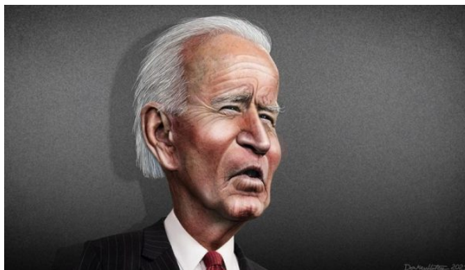
Joe Biden Donkey Hotey Cartoon

The union, which includes health workers from cleaning and building maintenance, focused its condemnation on Israel's military offensives on civilians and the humanitarian crisis they are unleashing in Gaza, stressing that SEIU members see themselves reflected in health workers in Gaza.