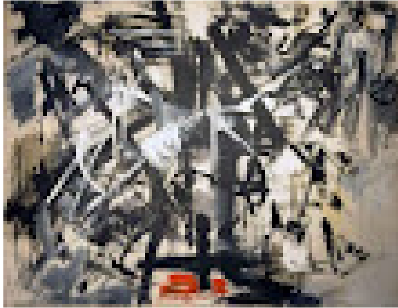
Emilio Vedova (Italy), Contemporary Crucifixion no. 4 , 1953.