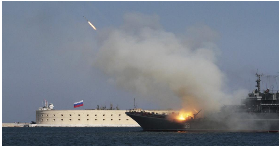
A Russian warship fires during celebrations to mark Navy Day in the Crimean port of Sevastopol July 27, 2014.