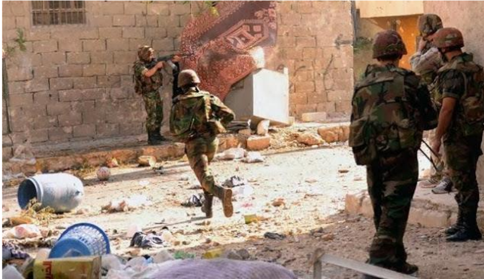
Image: The Syrian Arab Army is decisively winning the war through conventional means and would only invite the one possible method of changing that, foreign invention, through the use of chemical weapons. Commonsense, the evidence, and even the liars who would say otherwise, all point to NATO-backed terrorists as the culprits behind chemical weapon use in Syria’s ongoing conflict.

The lengthy report goes on in detail, covering the manner in which Western leaders intentionally manipulated or even outright fabricated intelligence to justify military intervention in Syria – eerily similar to the lies told to justify the invasion and occupation of Iraq, and the escalation of the war in Vietnam after the Gulf of Tonkin incident.