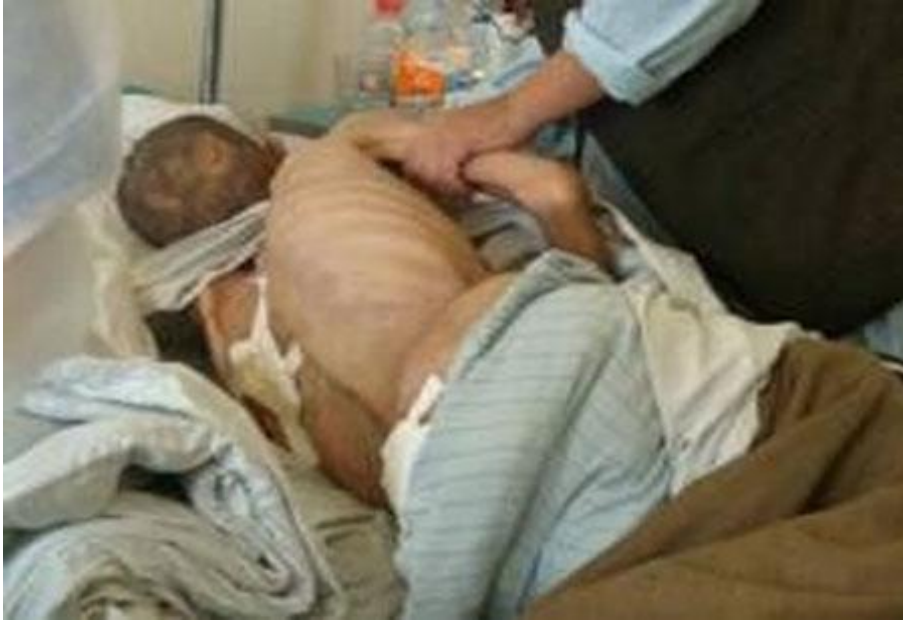
Maggots began falling out of this patient's wounds. He died a week later.