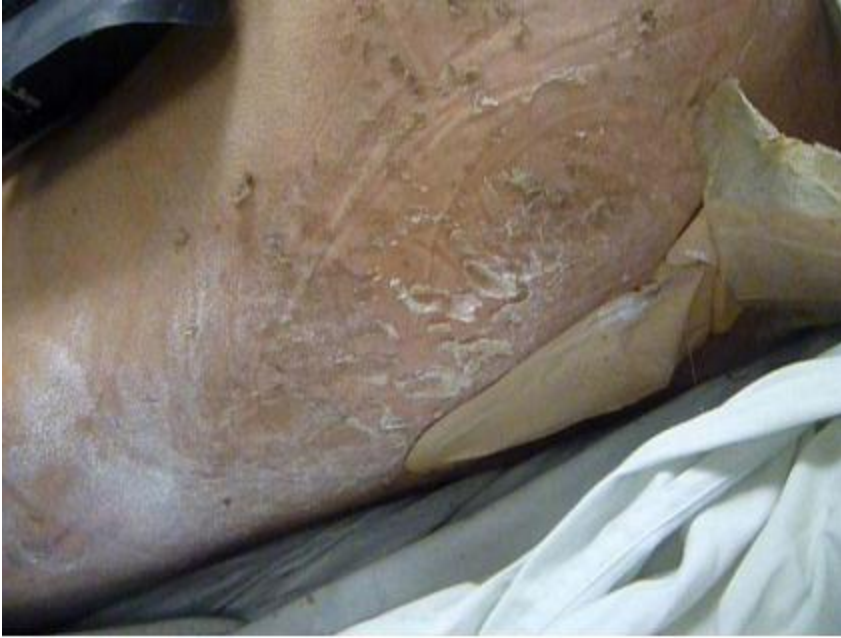
"Beginning stage of pressure ulceration."