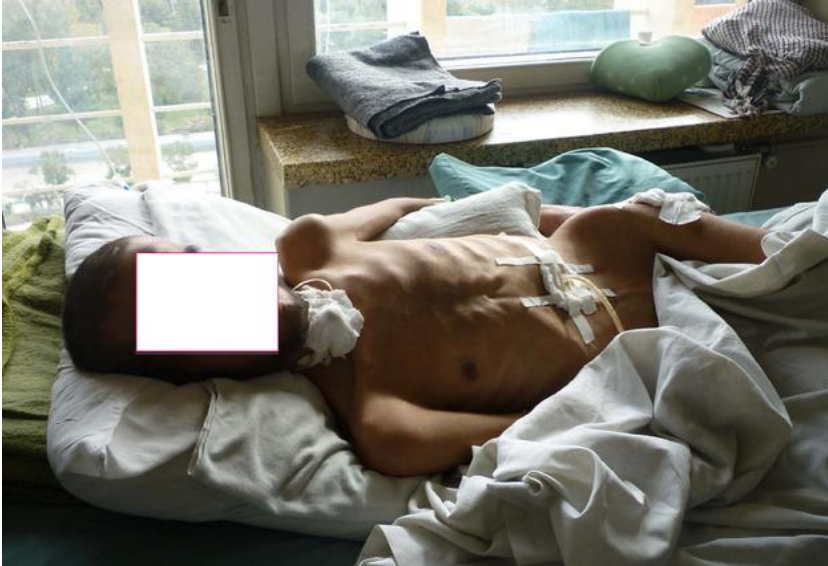
A patient's untreated wound.