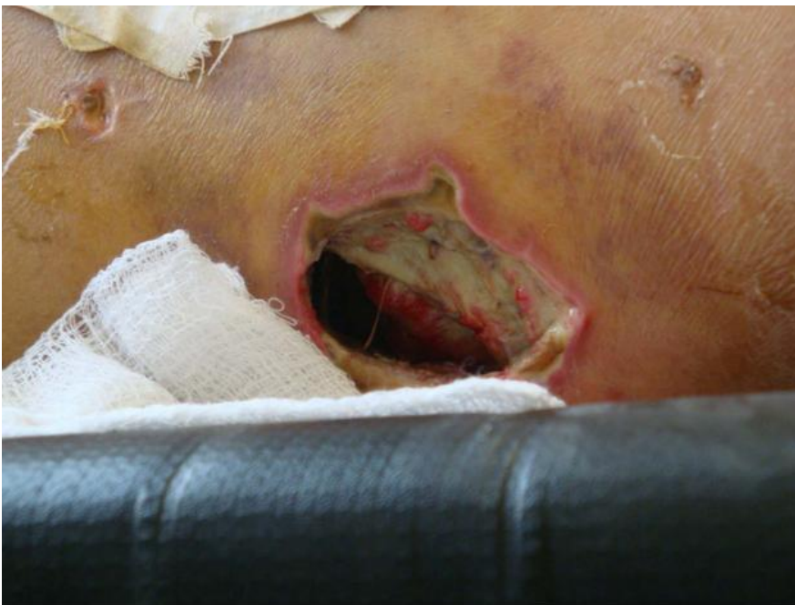
Investigators described this as "a sacral decubitus lesion with high grade tunneling." There were no plans for surgery for this patient.