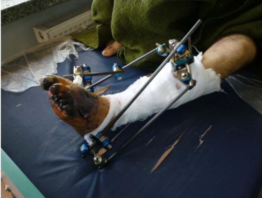
Gangrene set in, making this patient a candidate for amputation. The surgeon refused to "address the issue for days," according to the investigation.