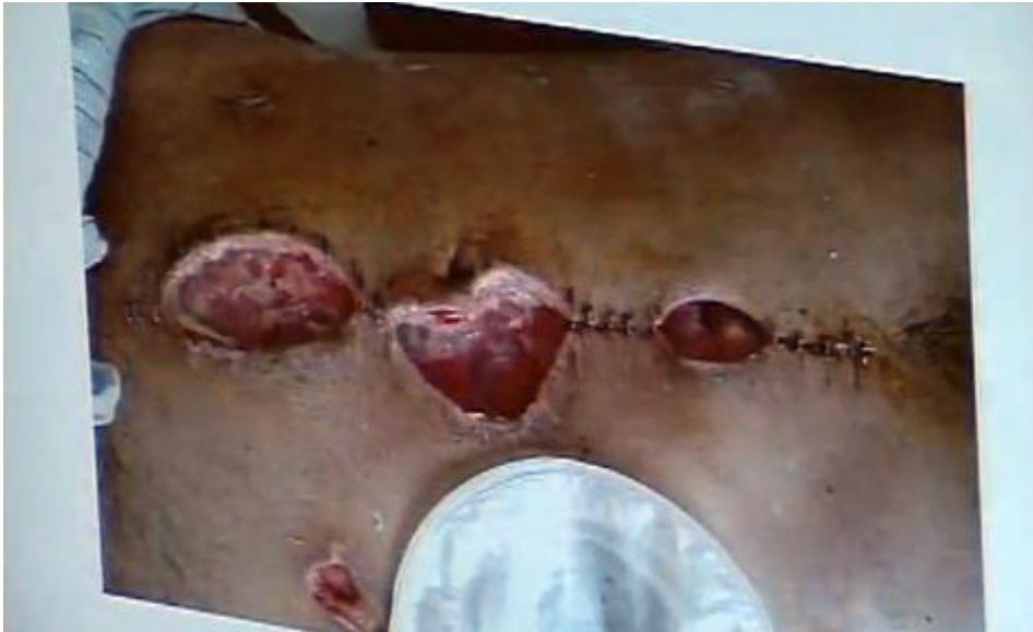
"The Auschwitz like conditions at the National Military Hospital."