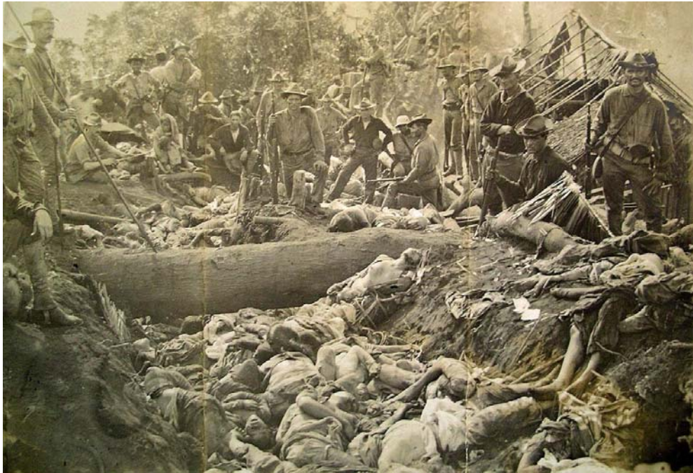
Bud Dajo massacre, 1906

Aguinaldo was captured in March 1901. Six months later, McKinley was “benevolently assimilated” by an anarchist’s bullet. Theodore Roosevelt became president of the United States. On July 4, 1902, he declared the war in the Philippines over. Guerrilla fighting continued over the course of nearly a decade, led by such figures as Gen Miguel Malvar and Gen Macario Sakay.