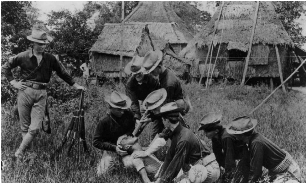
US soldiers administer the “water cure” torture

The Americans declared the Filipino combatants “bandits,” who were not to be accorded the rights of prisoners of war, and turned to the tools of counter-insurgency: torture, the reconcentration of large populations, and the execution of prisoners.