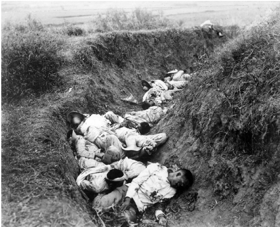
Filipino dead in the portion of the trenches on February 5, 1899, the first day of the war.

The Filipino forces, many barefoot and poorly armed, fought with immense courage. Motivated by political ideals and the desire to be free, they cited the American declaration of independence—that all men are created equal—and they were shot down by US troops.