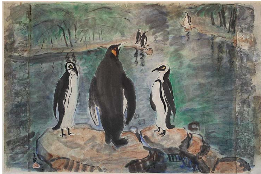
Pan Yuliang (China), Penguins , 1942.