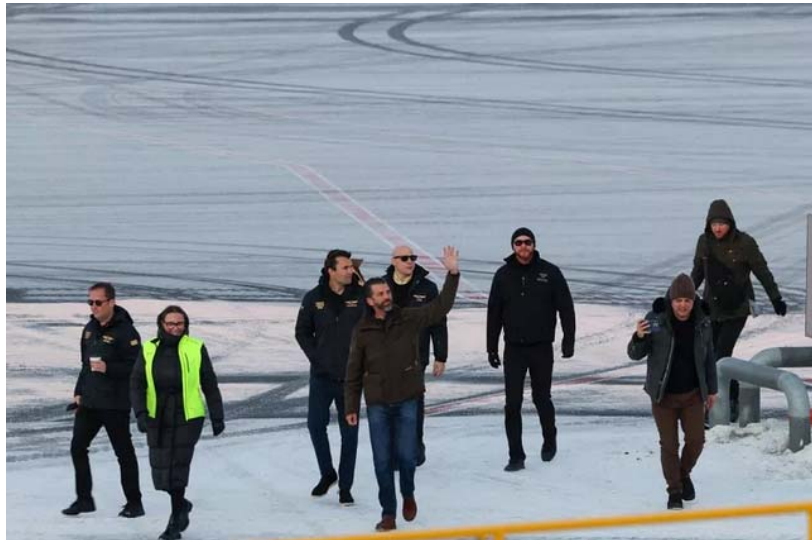
Donald Trump Jr. and his team “on vacation” in Greenland.

The purchase of Greenland could therefore easily take place without money. All that would be required would be for the Pentagon to ensure the protection of Denmark, thus freeing it from a financial burden.