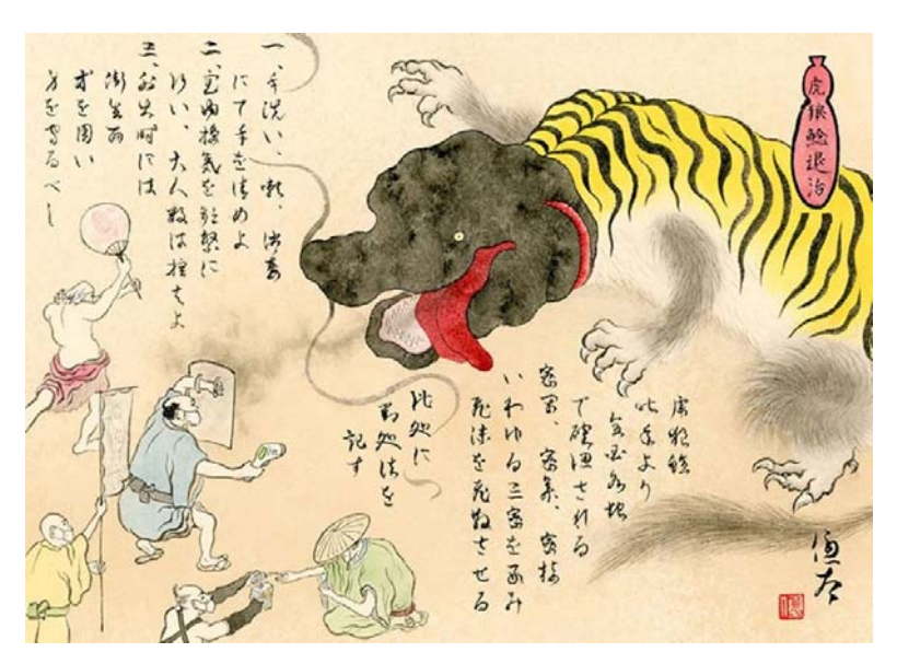
Yuta Niwa (Japan), Exterminating a Tiger-Wolf-Catfish, 2021.