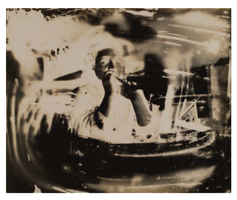
Shigeru Onishi (Japan), Flickering Aspect, 1950s.