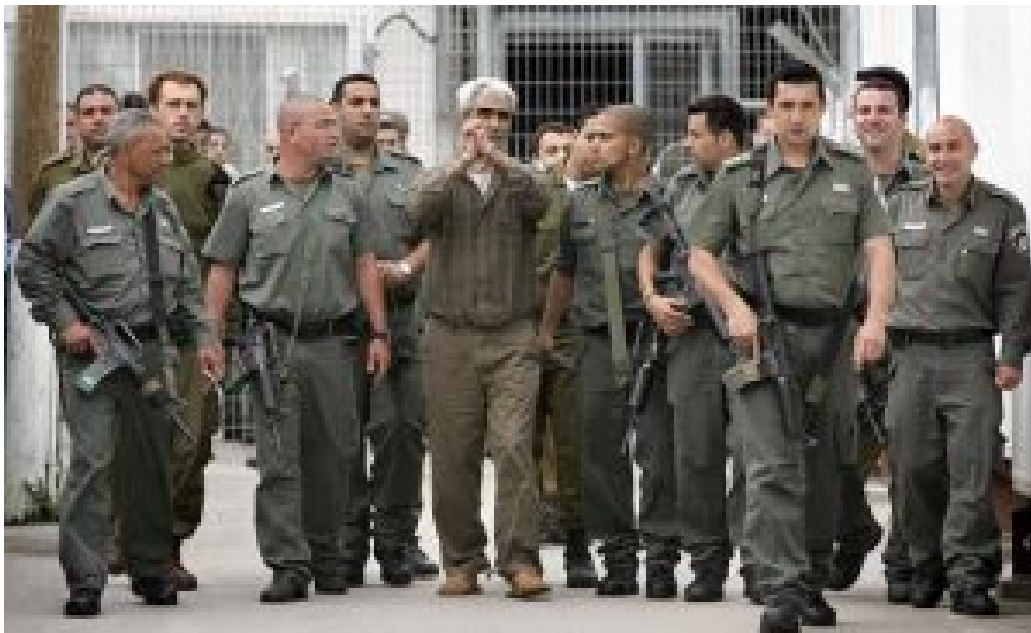
Ahmed Saadat, during his trial before the Israeli military court in Ofer in December 2008.

IRS: Yes, there are aspects that can be compared. But it's different, in my case it was a matter of money. They simply went to a head of state, to a person in charge there, they paid him money and it was not a question of politics, but of money, money. To me, to Osama bin Laden, the Sudanese sold us all.