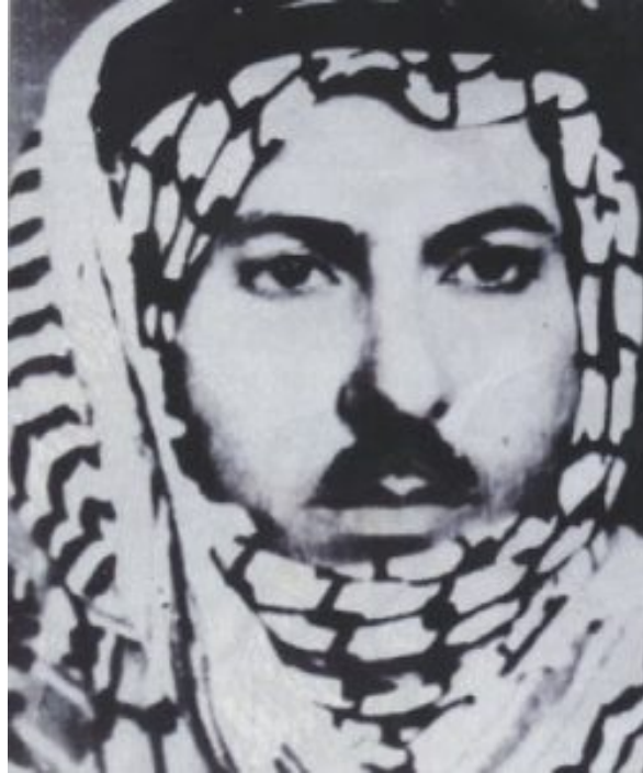
Wadi Haddad (1927-1978)

Ahmed Saadat, but no one did anything against the Israelis. The first person responsible is the leadership of the Popular Front itself.