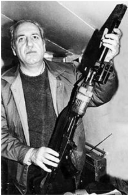
Ahmed Jibril (1938-2021)

Then we could hit hard, in and out and it turns out... Talking to Arafat many years ago, he recognized that there was nothing more he could do internally and the only ones we could were the PFLP and the PFLP's allies. So... That was the result of a good operation, the execution of that criminal who was Minister of Tourism, a retired general who had assassinated—I'll tell you why he was executed—many years ago there was an operation in Palestine, and then the comrades took a bus with hostages and finally surrendered, didn't they? And so, when they surrendered, they were executed on direct orders from that general. And they killed the guys in the commando. And for that reason he was executed in Jerusalem twenty years later. That was a long time ago.