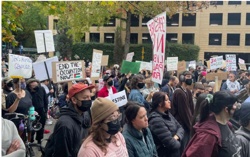
Part of the demonstration in Portland, Oregon, October 21, 2023

In Portland, Oregon, thousands of protestors gathered outside a federal congressman’s office in the northeast part of the city. There was a mixture of people from a wide range of ethnic and religious backgrounds, including many Jewish and Arab workers and youth.