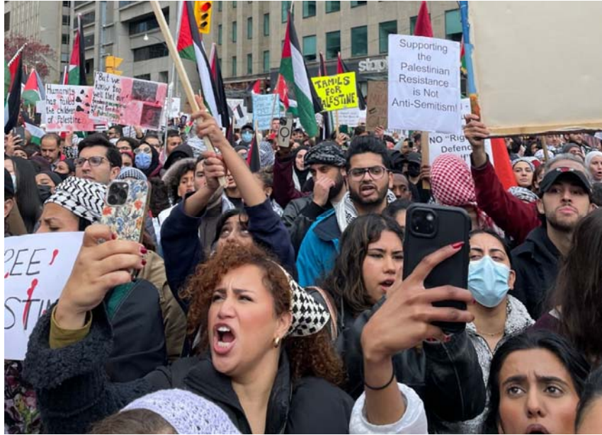
Part of the demonstration in Toronto, Canada, October 21, 2023

Demonstrators denounced the support of the Canadian and US governments for the criminal bombing of Gaza, chanting, “Justin Trudeau’s hands are red!” and “Joe Biden – your hands are red!” Many demonstrators carried signs opposing the occupation and genocide and affirming the right of Palestinians to resist it.