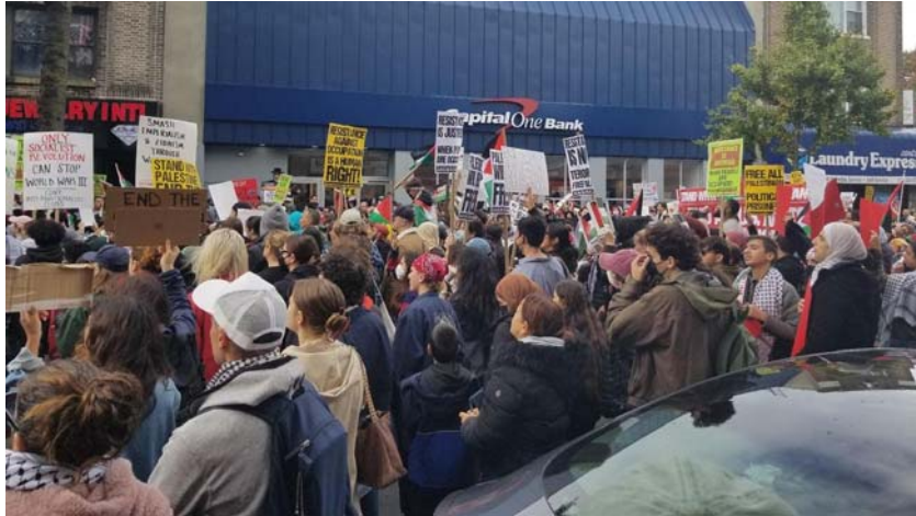
Protesters in Brooklyn, New York, October 21, 2023.