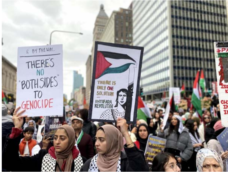
A section of the protest in Chicago, October 21, 2023

A group of young workers and students also spoke to WSWS reporters and expressed interest in attending the Chicago meeting on October 25th . One was from Guatemala, and one from Bosnia. Both spoke out in solidarity with the Palestinians, as their own families were forced to flee their countries because of attacks by US imperialism.