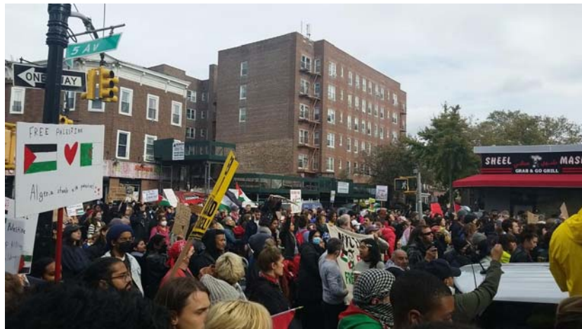
Bay Ridge, Brooklyn, New York, October 21, 2023.

In Bay Ridge, Brooklyn on Saturday, an initial crowd of about 1,000 protesters swelled to 10,000 by mid-afternoon.