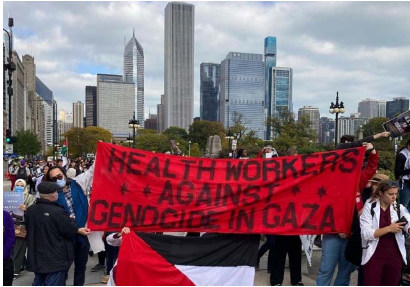
Banner at the protest in Chicago, October 21, 2023

One of them shared a story of doctors who are working under these conditions and seeing their own family members brought in, injured or killed in the bombing raids. One raised opposition to their union leadership in the US. The union had ignored demands from the rank and file to issue a statement opposed to the war. He made an appeal to rank-and-file health care workers to demand that their union oppose the war.