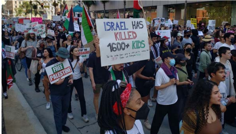
Thousands march in Los Angeles, October 21, 2023.