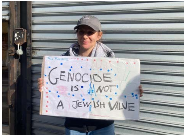
A protester in Brooklyn, October 21, 2023