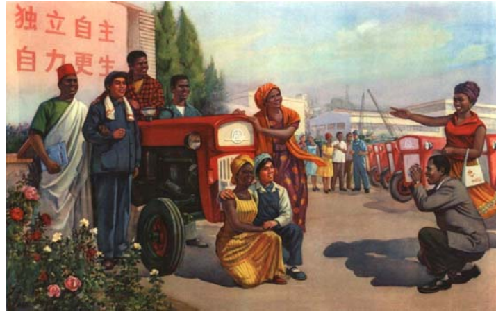
Guo Hongwu (China), 革命友谊深如海 ('Revolutionary Friendship Is as Deep as the Ocean'), 1975.

The Western-backed governments that followed these coups often reversed the policies to exercise national sovereignty and build continental unity. For instance, in 1966, the military leaders of Ghana's National Liberation Council began to gut the policy of establishing quality public education and an efficient public sector with industrialisation and continental trade at its centre. Import-substitution policies that had been important to the new Third World states were rejected in favour of exporting cheapened raw materials and importing expensive finished products. The spiral of debt and dependency wracked the continent. This situation was worsened by the International Monetary Fund's Structural Adjustment Programmes, set in motion during the worst of the 1980s debt crisis. A 2009 research paper from the South Centre noted that 'the continent is the least industrialised region of the world, while the share of sub-Saharan Africa in global manufacturing value added actually declined in most sectors between 1990 and 2000'. Indeed, the South Centre paper referred to the situation in Africa as one of 'de-industrialisation'.