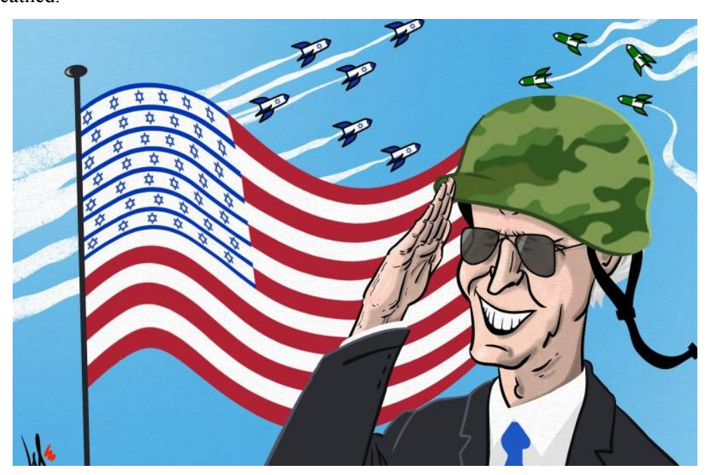
Highly illustrative is the "moral reaction" that has been inflicted on Zionists scandalized by the Biden administration's novel demands on the State of Israel regarding "Palestinian rights."

Biden cannot bear so much Israeli pain and vexation: "He told Herzog to send Netanyahu the conviction that America's commitment to Israel is firm and bulletproof." (ibid.) And for reconciliation to be full, Biden has promised a "national plan against anti-Semitism." The Double Alliance (which is actually a triple one, with the United Kingdom) remains unscathed.