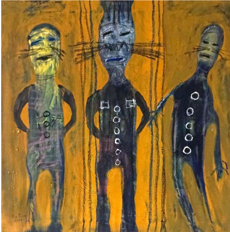
Wilfried Balima (Burkina Faso), Les trois camarades ('The Three Comrades'), 2018.