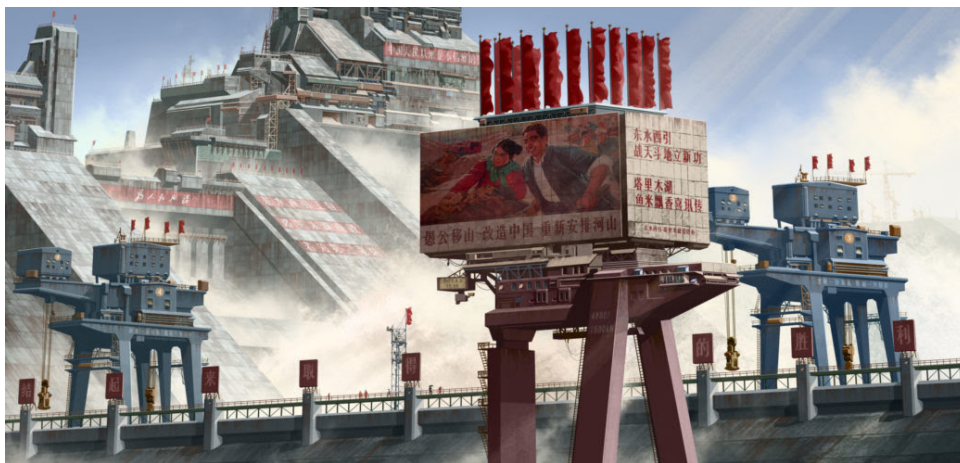
Fan Wennan (China), 中国2098: 塔里木湖南段—若羌泵站 ('China 2098: Tarim Hunan Section – Ruoqiang Pumping Station'), 2019–2022.

Wang Xiaoyi takes us to the countryside, where the problems of poverty once seemed intractable, and looks at how rural areas had been hollowed out by mass migrations and rural institutions impoverished during the post-1978 reform period. Central to the programme to eradicate extreme poverty, Wang points out, was the rebuilding of rural institutions, which was enabled by the transfer of three million CPC cadre to the countryside, mobilised by experiments that drew from the campaign-style governance of the Mao Zedong era. Wang hopes that the new rural infrastructure created by the programme to eradicate extreme poverty will remain in place, including the 'high level of villagers' participation in public affairs' through their village committees.