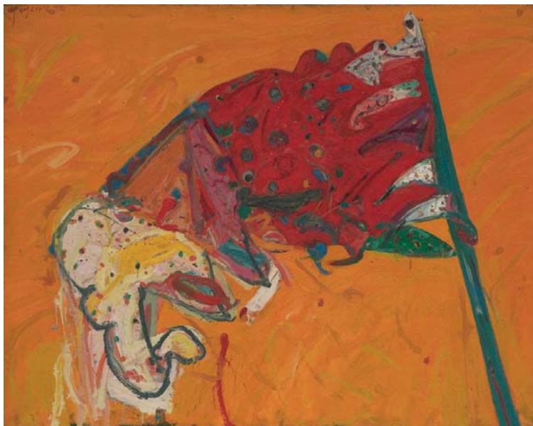
Slobodan Trajković (Yugoslavia), The Flag , 1983.

At the Asian-African Conference held in Bandung, Indonesia in April 1955, India’s Prime Minister Jawaharlal Nehru reacted strongly to the creation of these military alliances, which exported tensions between the US and the USSR across Asia. The concept of NATO, he said , ‘has extended itself in two ways’: first, NATO ‘has gone far away from the Atlantic and has reached other oceans and seas’ and second, ‘NATO today is one of the most powerful protectors of colonialism’. As an example, Nehru pointed to Goa, which was still held by fascist Portugal and whose grip had been validated by NATO members – an act, Nehru said, of ‘gross impertinence’. This characterisation of NATO as a global belligerent and defender of colonialism remains intact, with some modifications.