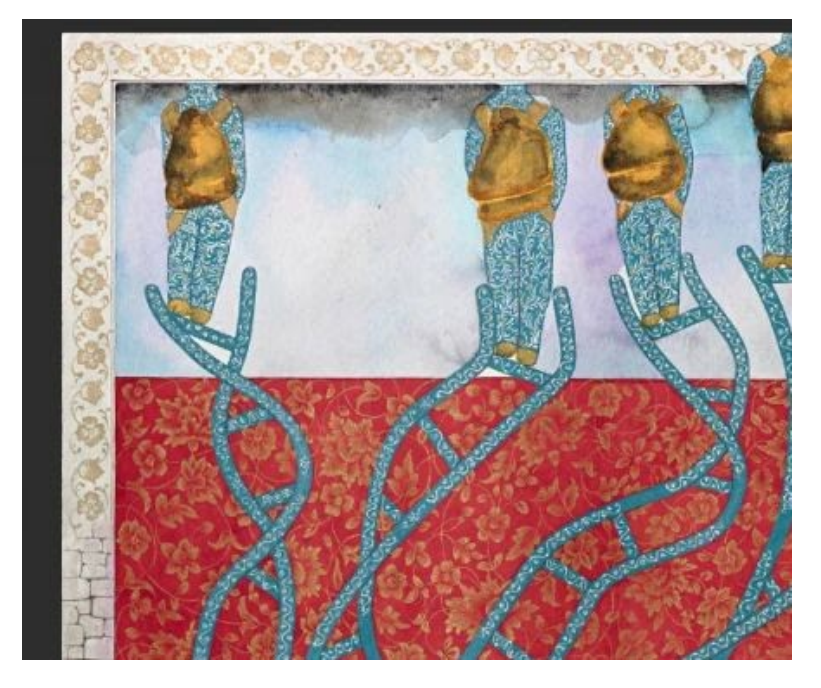
Francesco Clemente (Italy), Sixteen Amulets for the Road (XII), 2012–2013.

G7 leaders stand before the cameras pretending to be world representatives whose views are the views of all of humanity. Remarkably, G7 countries only contain 10 per cent of the world's population while their combined Gross Domestic Product (GDP) is merely <u>27 per</u> <u>cent</u> of global GDP. These are demographically and increasingly economically marginalised states that want to use their authority, partly derived from their <u>military</u> <u>power</u>, to control the world order. Such a small section of the human population should not be allowed to speak for all of us, since their experiences and interests are neither universal nor can they be trusted to set aside their own parochial goals in favour of humanity's needs.