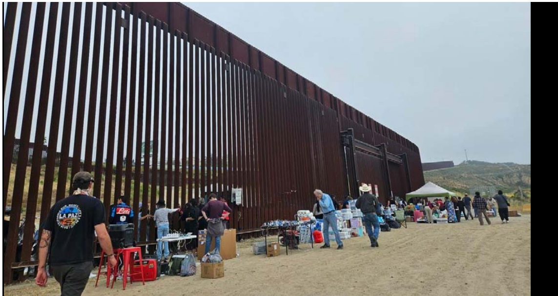
Volunteers organize distribution of basic necessities to migrants.

Department of Homeland Security (DHS) chief Alejandro Mayorkas is leading the Biden administration’s new policy requiring asylum seekers to file for asylum in their home country or in “regional processing centers” to be set up in the very countries migrants are attempting to flee.