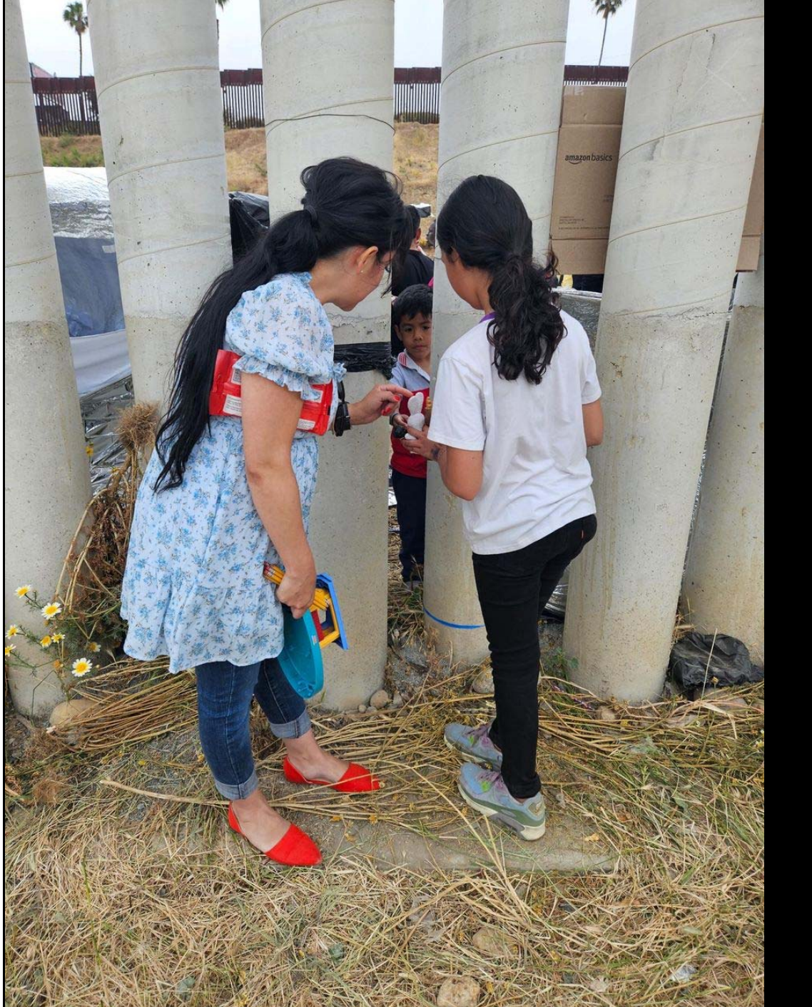
A woman and girl distribute toys and coloring books to children.

It wasn't possible for my children to come. Aside from my father, who is working in California, all my family is in Guatemala. It's been so difficult making this journey alone. I have been suffering and I'm depressed. I have no support, I don't have anything. The only thing I hope is that they don't send me back.