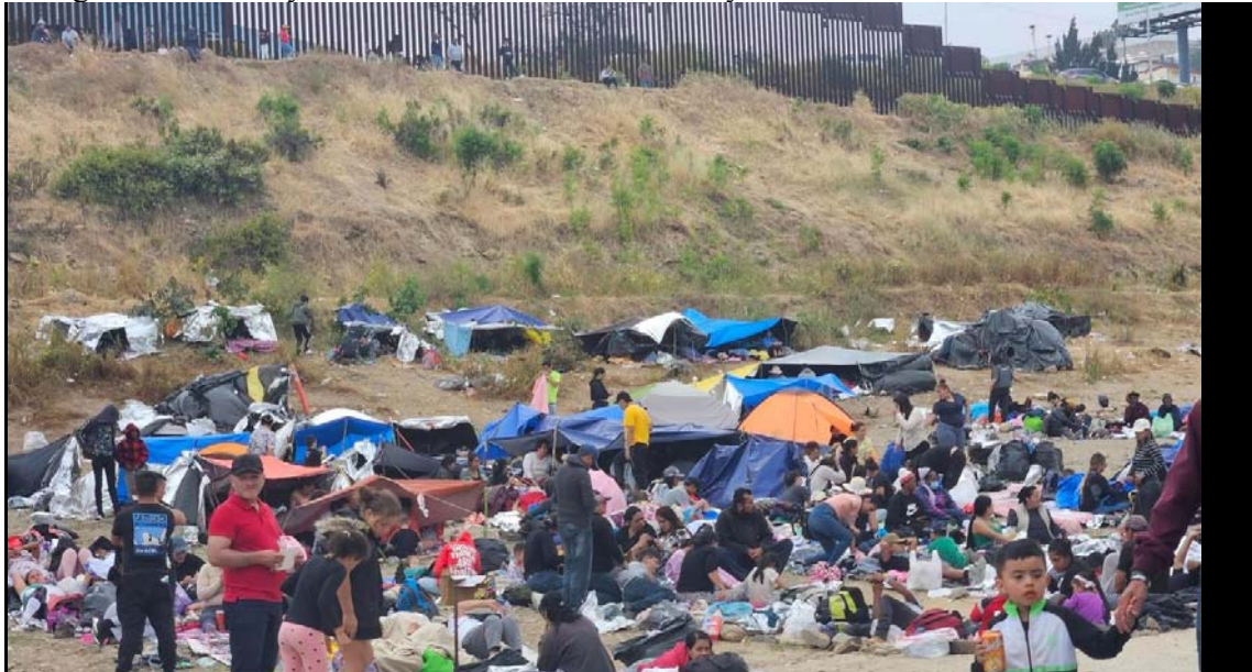
An encampment of some 300 adults and children near the San Ysidro port of entry

The conditions here at the camp are not easy. I don’t have money so it makes everything more complicated. I cannot buy food, so we eat what we can get. Sometimes there’s not enough food for everyone. I haven’t eaten for three days.