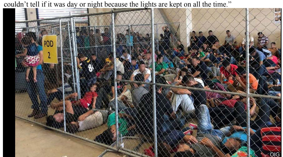
Immigrant children at a detention center in McAllen Texas, June 2019.

was really cold. I only was allowed to wash once a day. The bathrooms were very dirty and you could see everything, including the excrement, which was everywhere in the bathroom. We had to sleep on the floor using aluminum blankets which are very uncomfortable. I was in La Hielera for one night and then I was in 'La Perrera'—the doghouse—for two days. I