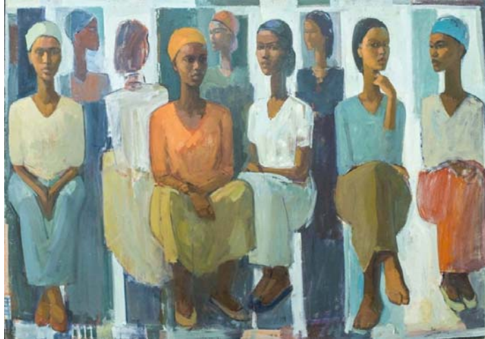
Tadesse Mesfin (Ethiopia), Pillars of Life: Market Day , 2018.

write in dossier no. 63 , we operate with ‘the knowledge that the permanent debt crisis besieging the poorer nations... it is not fully a consequence of governments’ mismanagement of finances or deep-rooted corruption’. Nonetheless, the idea of corruption is used as a stick to beat poor countries, without any self-awareness of the internalised transaction costs in the richer states (where enormous corporate political donations, coupled with the revolving door between high-level government positions and private-sector employment, often serve as a substitute for overt bribes). Next year, we will provide an assessment of the debate around the integrity of public institutions.