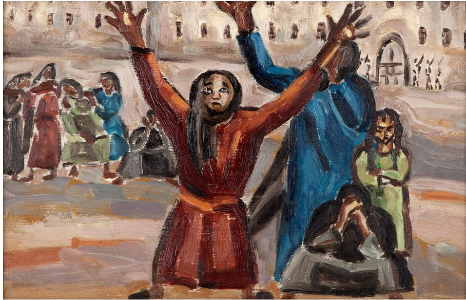
Inji Effaltoun (Egypt), The Prisoners , 1957.

At Tricontinental: Institute for Social Research, we have been closely watching the expanding IMF-driven debt crisis, which has converted the idea of ‘financing for development’ into ‘financing for debt servicing’. But financial debt is only one of at least three major deficits that currently bedevil the Global South, the other two being deficits in science and technology as well as political integrity.