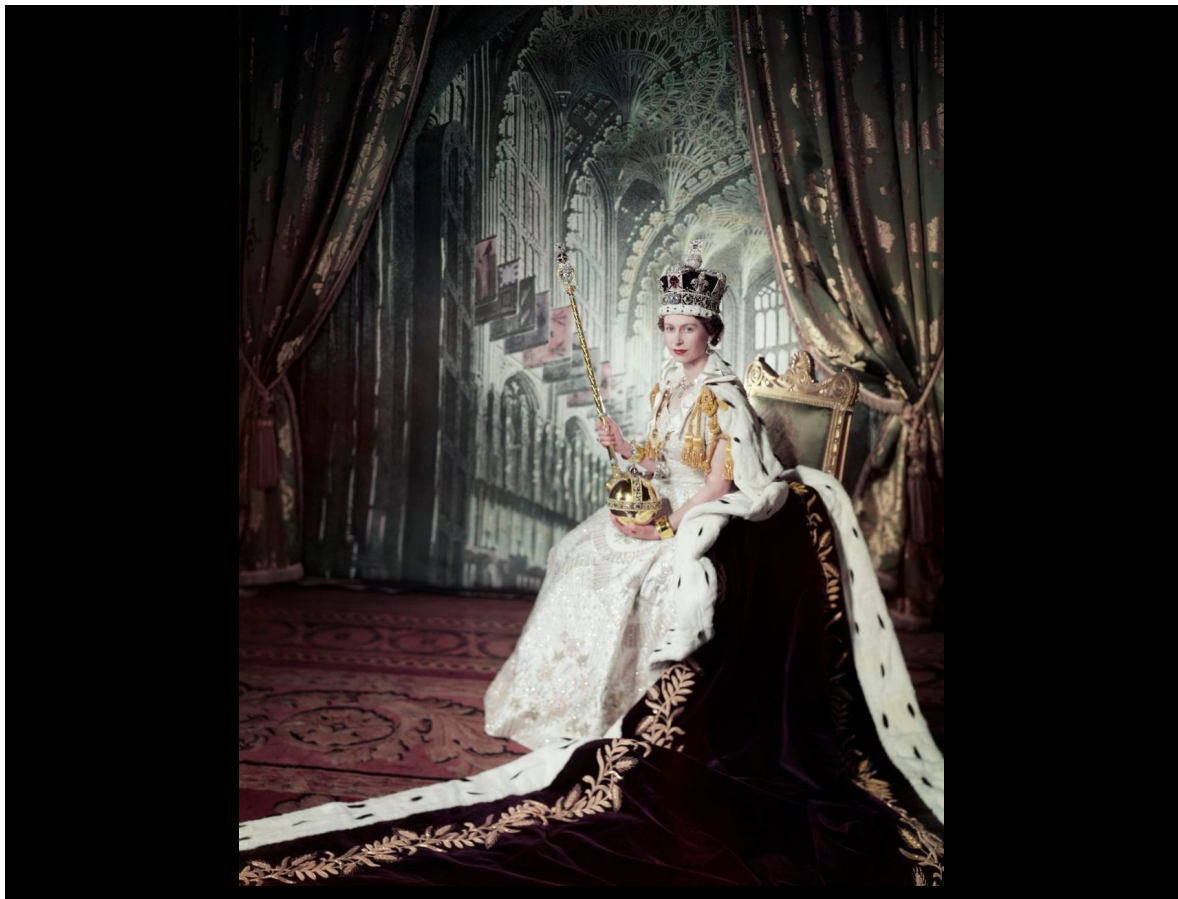
Coronation portrait of Queen Elizabeth II, by Cecil Beaton, June 1953, London, England. [Photo: Cecil Beaton/Royal Collection RCIN 2153177]

As proof of Britain's military might, for example, more than 6,000 members of the armed forces will take part, with prominent roles for Admiral Sir Tony Radakin, chief of the defence staff, and General Sir Patrick Sanders, chief of the general staff, with a flypast by 68 aircraft from all three of the Armed Forces. But royal commentators have contrasted this display to the 600 RAF and Commonwealth planes which took to the skies for Elizabeth. The coronation will be attended by 2,000 guests compared with Elizabeth's more than 8,000. "The King is acutely aware of the cost of living crisis and just how many people are struggling," a royal source told the Daily Mirror .