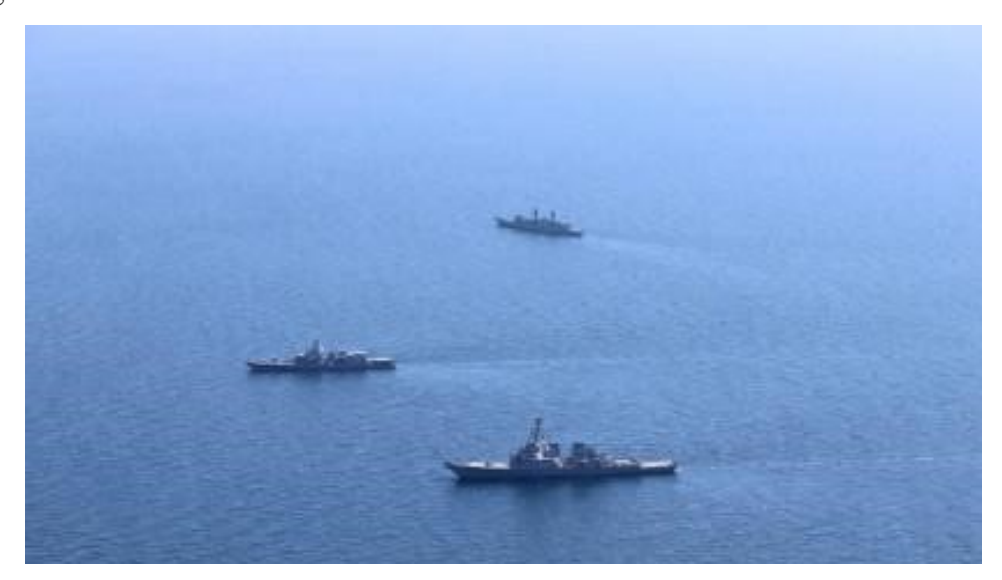
Exercise Sea Breeze: 32 ships, 40 aircraft and 5,000 NATO troops in the Black Sea.

Between the end of June and the beginning of July 2021, the Sea Breeze exercises in the Black Sea, which had been taking place for a long time. The latter was the largest. 20 participants NATO countries: Canada, United States, France, Italy, Poland, United Kingdom and Sweden, among others. From the "basin" of the Black Sea made Bulgaria, Georgia, Romania and Turkey – all four in NATO – and Ukraine: five of the six countries bordering the Black Sea. The other –y The only one left out – it was Russia, oh coincidence! Between July and September continued the transit of American warships through the Black Sea.