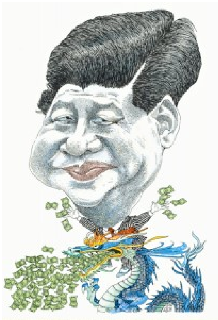
Xi Jinping, President of China

Sino-Russian cooperation in high technology will skyrocket: 79 projects worth more than $165 billion. There will be everything from liquefied natural gas (LNG) to aircraft construction, machine tool construction, space research, agribusiness and improved economic corridors.