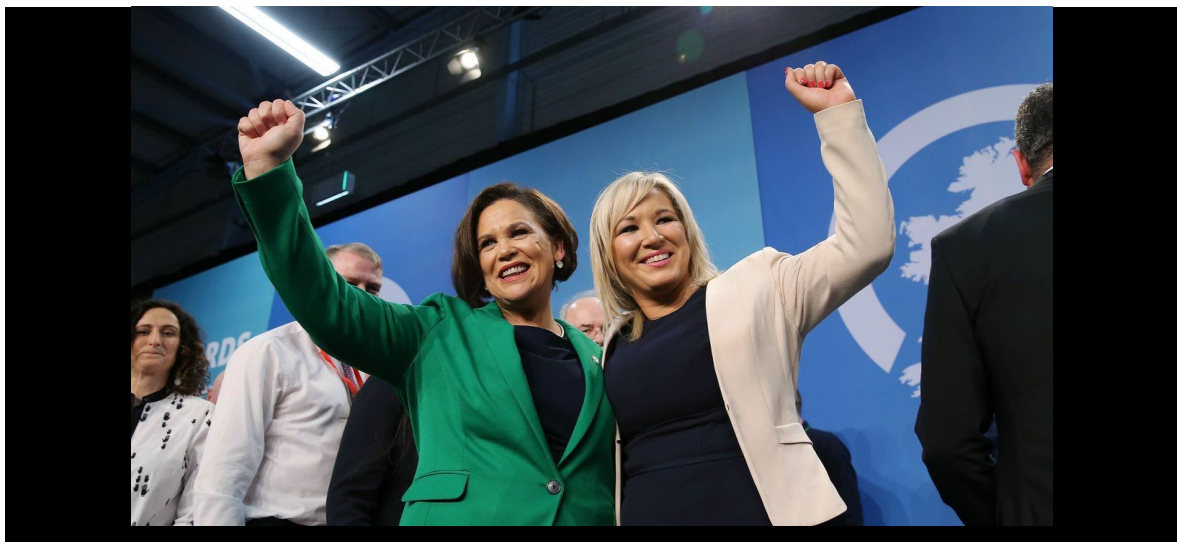
Sinn Féin President Mary Lou McDonald and Vice President Michelle O'Neill in 2018

Sinn Féin leader Mary Lou McDonald tweeted, “President Biden’s support for the Good Friday Agreement and the protection of Irish interests remains consistent and unequivocal.”