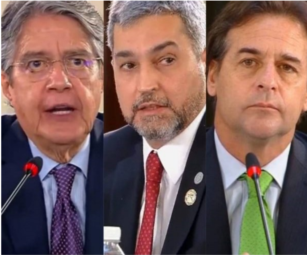
Guillermo Lasso, Mario Abdo y Luis Alberto Lacalle Pou

The crisis unleashed by the violence motivated, within the National Assembly, the constitution of an Investigative Commission on drug trafficking activities. For the formation of this instance, however, the members of the Citizen Revolution party (correísmo) were excluded.