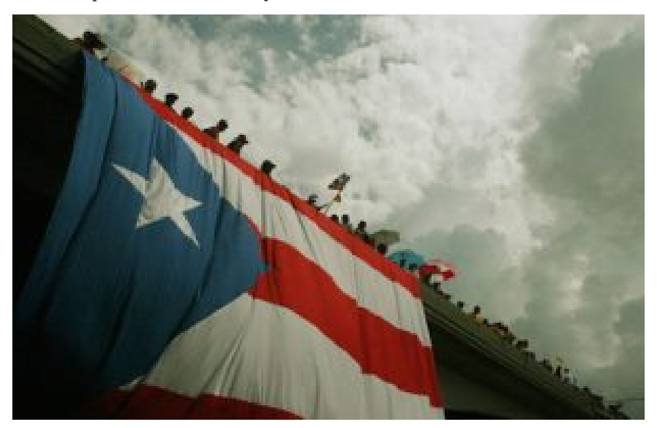
San Juan, Puerto Rico

in the majority. Just brush up on recent international headlines. In our case, the dominance of these unelected powers because they are colonies is double-stitched.