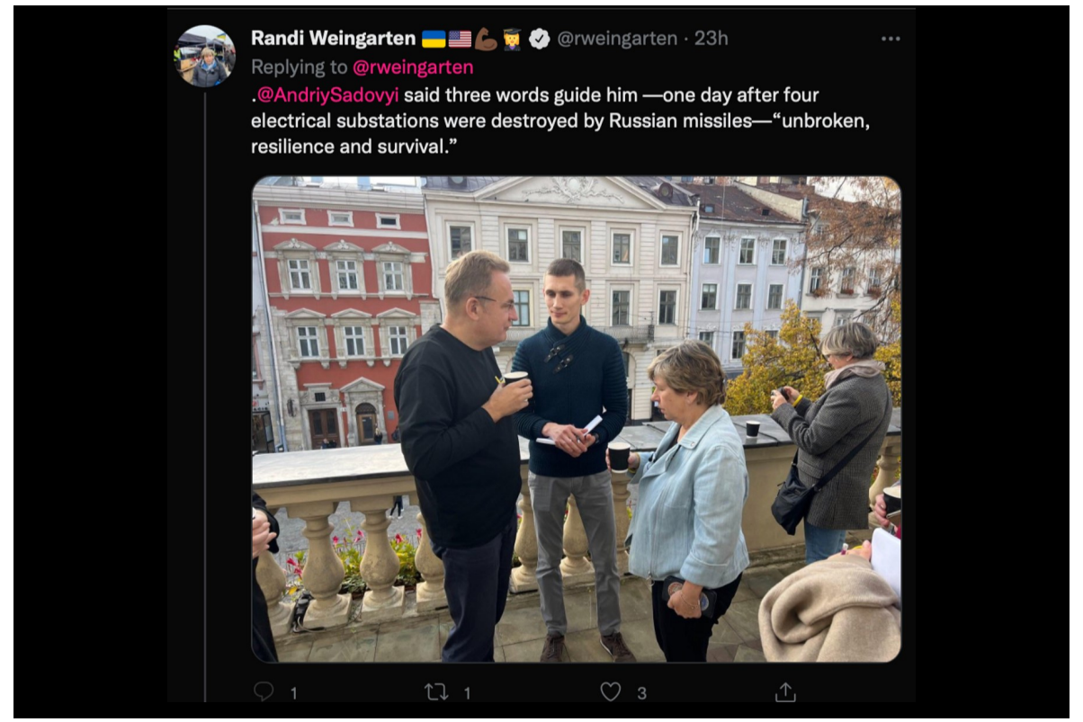
One of Randi Weingarten's tweets on her meeting with Lviv's mayor Andriy Sadovyi from October 12, 2022

<u>mayor of Lviv, Andriy Sadovyi,</u> who has long been a central figure in the state-led rehabilitation of Ukrainian fascism and an open admirer of Stepan Bandera.