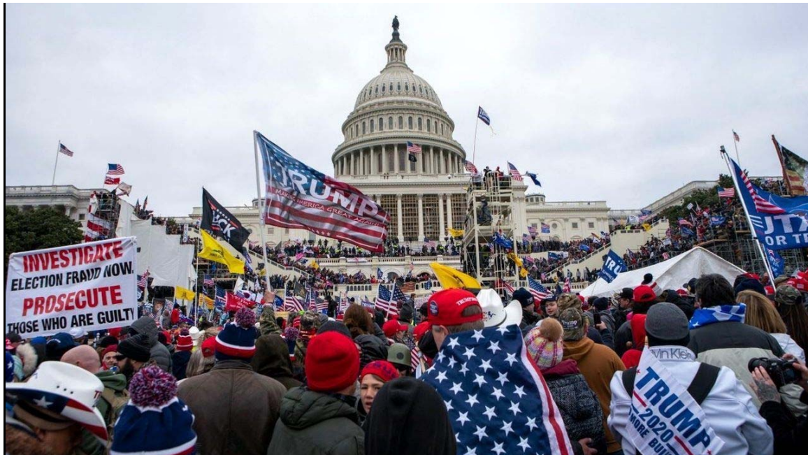
On Jan. 6, 2021 right-wing rioters loyal to President Donald Trump storm the US Capitol in Washington in a coup attempt.

35. The recklessness of US foreign policy cannot be understood solely in relation to the geopolitical interests of American imperialism. A central factor is the extreme domestic crisis within the United States itself. For all its dreams of global conquest, the American ruling class presides over an increasingly dysfunctional political system. As far back as the Clinton impeachment crisis of 1998-99 and the Supreme Court’s intervention in 2000 to suppress the counting of votes and award the presidency to George W. Bush, the International Committee has warned that the American ruling class was moving toward dictatorial forms of rule.