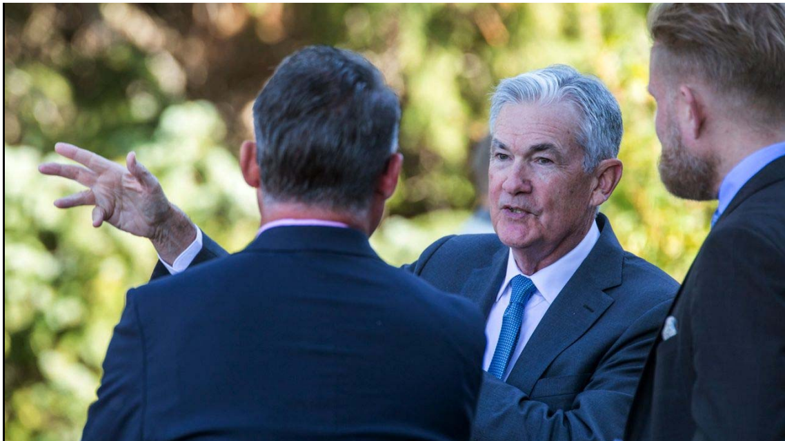
Federal Reserve Chair Jerome Powell, center, takes a coffee break with attendees of the central bank’s annual symposium at Jackson Lake Lodge in Grand Teton National Park Friday, Aug. 26, 2022. in Moran, Wyo.

45. The American ruling class responded to the 2008 economic and financial meltdown with a bailout of Wall Street. The national debt was doubled virtually overnight to finance the purchase of hundreds of billions of dollars in speculative assets by the Federal Reserve. This was repeated on an even greater scale in 2020 during the initial months of the COVID-19 pandemic, propelling share values to record levels amidst mass death and social misery.