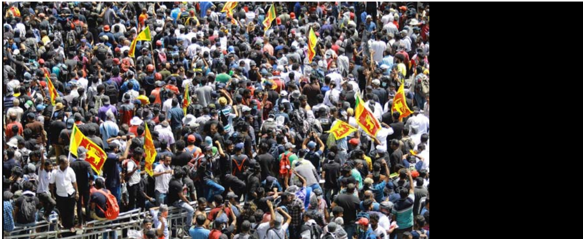
Protesters gather in a street leading to the president’s official residence in Colombo, Sri Lanka, Saturday, July 9, 2022.

56. A major factor in the growth of social unrest has been the rising cost of living, including soaring prices for basic necessities. According to the International Monetary Fund (IMF), the price of wheat increased 80 percent between April 2020 and December 2021 as the global COVID-19 pandemic took hold, sending food prices to their highest levels since the 1970s. Wheat prices have jumped 37 percent and corn 21 percent so far in 2022. Wheat futures are 80 percent higher than six months ago, and corn is up 58 percent.