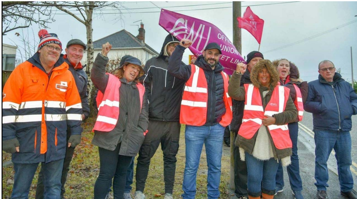
Strikers at Alder Hills delivery office, Bournemouth, December 23, 2022

66. In Europe, the French government of President Emmanuel Macron was rocked by a series of strikes by oil refinery workers. After threatening to requisition strikers to force them back on the job, Macron ultimately secured the services of the CGT unions in strangling the offensive. Developments in Germany were also marked by a radicalization of the working class, which found expression in a series of strikes. In the fall, the metalworkers' union IG Metall was forced to call hundreds of thousands of workers on a warning strike to control the growing anger of workers over the effects of inflation and the war policies of the German government. Other significant strikes occurred in the nursing and aviation sectors throughout the year and among dockworkers in the summer.