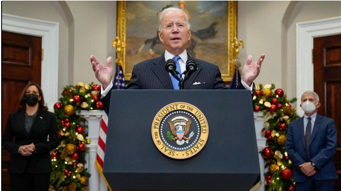
US President Joe Biden giving a speech downplaying the dangers of Omicron three days after it was declared a variant of concern by the WHO.

“live virus vaccination,” whose spread would endow some level of immunity, and on this basis the coronavirus would fade away.