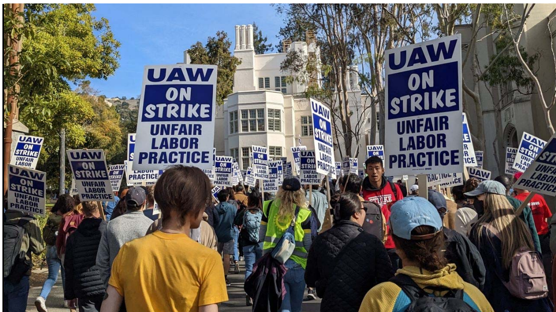
UC strikers at the Berkeley campus, Monday, November 21, 2022

70. In Canada, 55,000 education support workers in Ontario defied an anti-strike law, which generated broad support in the working class for a general strike against the far-right provincial government of Doug Ford, which was only blocked through the shutdown of the strike by the unions.