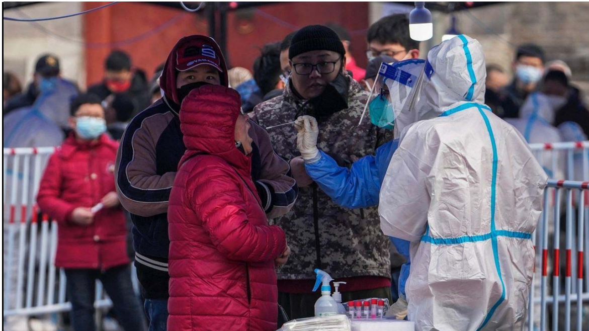
Health care workers in Beijing taking throat swabs of residents to trace coronavirus cases during last year’s Omicron surge.

9. Until November 2022, China adhered to a policy of “Zero COVID,” that is, the implementation of the well-known public health measures necessary to stop the spread of the virus. In the first three years of the pandemic, this policy limited COVID-19 deaths in China to just over 5,000, out of a population of 1.4 billion, or 0.1 percent of the US death rate during that time. In March-June 2022, the Zero-COVID strategy successfully stopped an outbreak of the Omicron BA.2 subvariant in Shanghai, proving that it is effective in combating even this highly infectious variant.