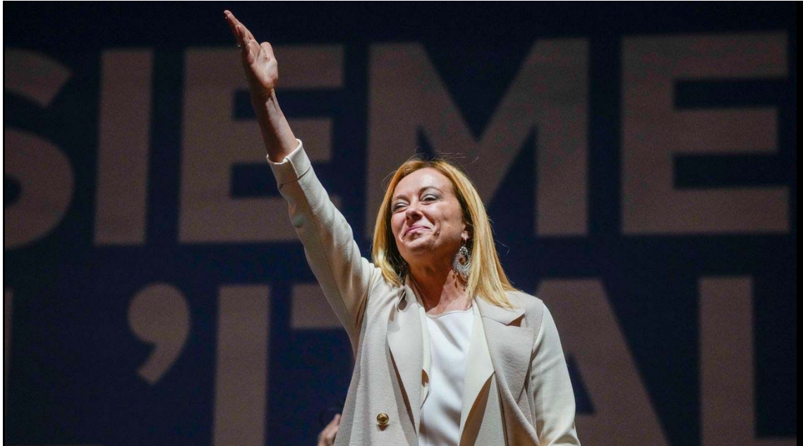
Brothers of Italy's Giorgia Meloni attends the center-right coalition closing rally in Rome, Sept. 22, 2022

40. The breakdown of democracy and the growing political influence of far-right and fascistic movements is a global phenomenon. In Italy, the Brothers of Italy (FdI), the successors to the fascist Italian Social Movement and the heirs of fascist dictator Benito Mussolini, came to power in October, headed by Prime Minister Giorgia Meloni. In France, the neo-fascist candidate, Marine Le Pen, won 45 percent of the vote in run-off elections against Emmanuel Macron in March. In Germany, where the Nazi dictatorship was responsible for the worst crimes of the 20th century, a raid in December exposed a fascist terrorist plot to seize power by military force. The “Reichsbürger” movement has close ties to the far-right Alternative for Germany (AfD), and the neo-Nazi movement has intimate connections within the intelligence and military apparatus.