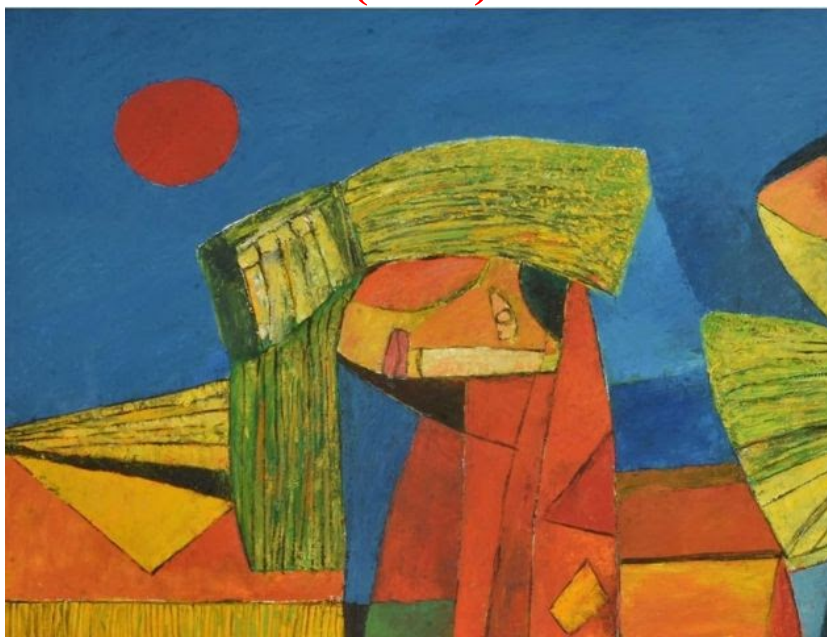
Ang Kiukok (Philippines), Harvest , 2004.