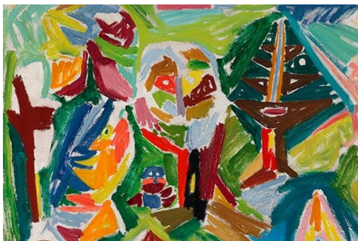
Asger Jorn (Denmark), Landscape in Finkidong , 1945.