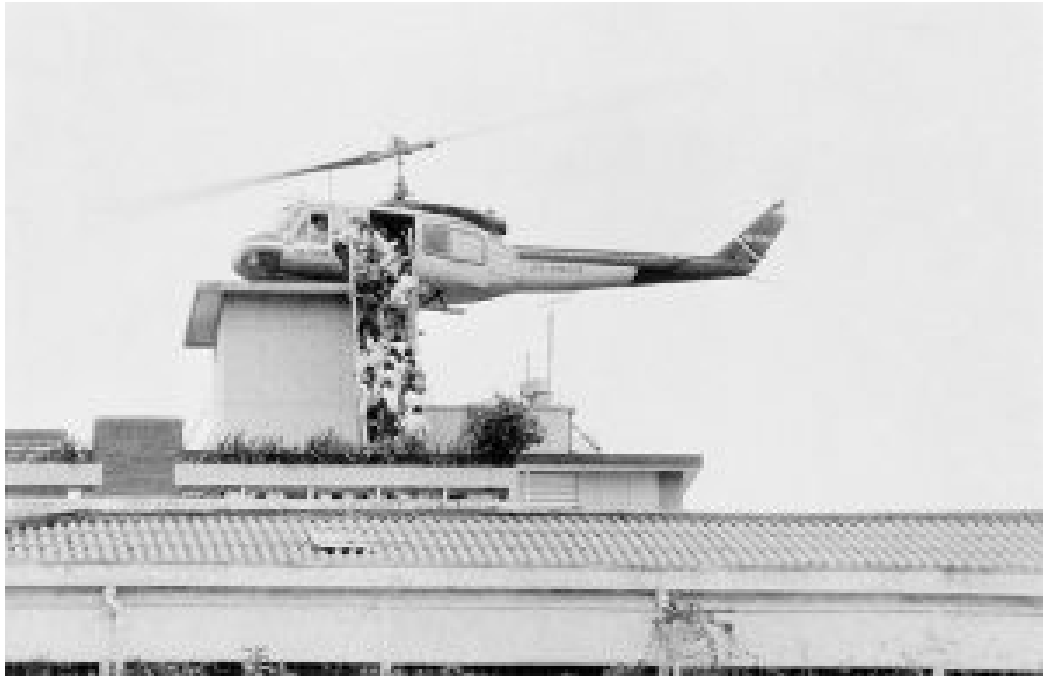
Flight from saigon on April 30, 1975. The Helicopter that will haunt Joe Biden