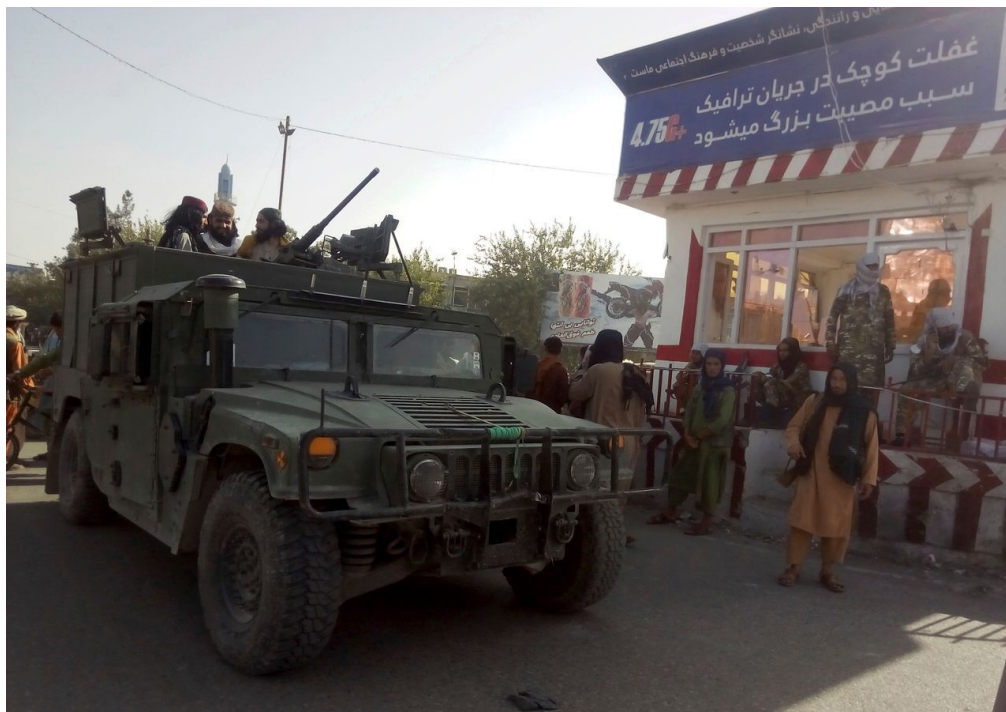
Taliban fighters at a checkpoint in Kunduz on 9 August, 2021

Politicians and the media in Germany are reacting to the Taliban advance following the withdrawal of NATO troops from Afghanistan with a mixture of disillusionment, anger and calls for a renewed military intervention.