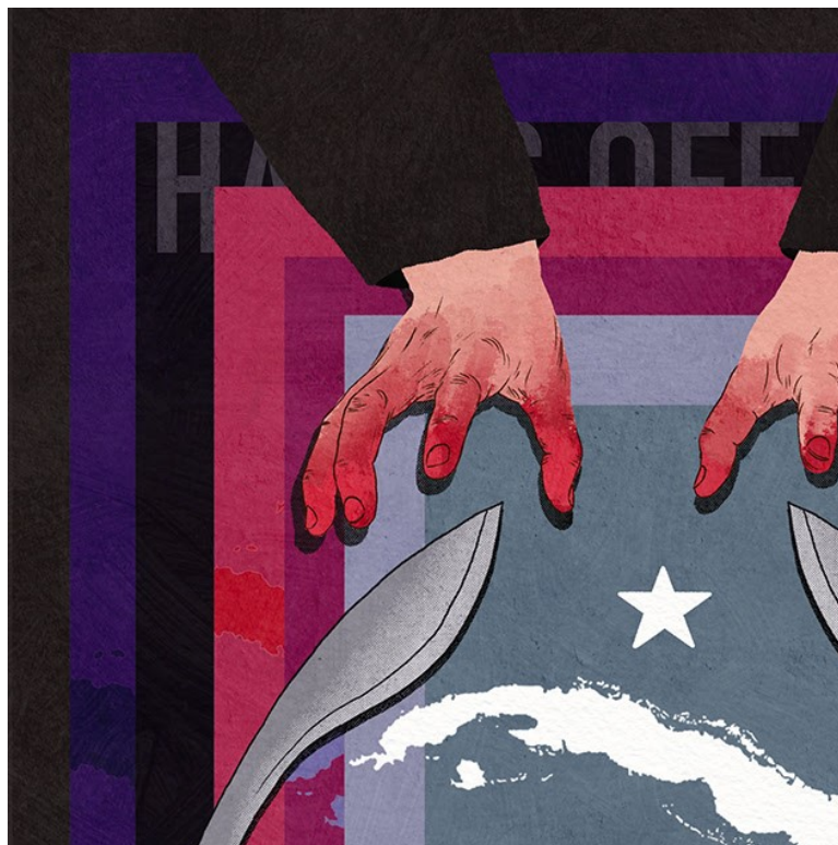
Lizzie Suarez (US), Hands Off Cuba! , 2021.

Cuba needs material support, which is lacking from the international community; this material support would include supplies for the Cuban pharmaceutical industry, for example, and it would include food. If the US does not roll back the blockade, will key countries of the world come together to break it?