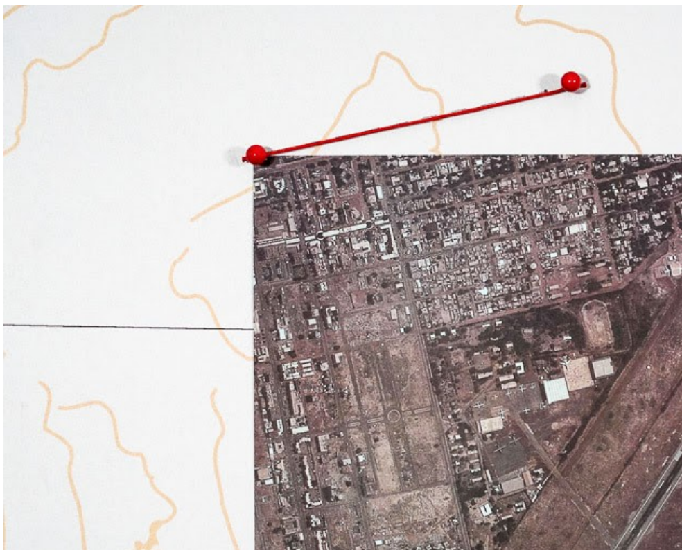
Ouagadougou, Burkina Faso

The exercise was conducted under the command of Major General Rohling and General Belkhir El Farouk, the Royal Moroccan Armed Forces Southern Zone commander. It is important to note that General El Farouk's jurisdiction covers the Moroccan occupation of Western Sahara. On 10 December 2020, US President Donald Trump offered Morocco recognition of its illegal occupation of Western Sahara in exchange for Morocco normalising its relations with Israel. Trump's statement on Western Sahara goes against a range of UN General Assembly resolutions, including 1514 (XV) from 1960, which affirms that all people from former colonies have the right to self-determination, and 34/37 from 1979, which explicitly calls for an end to Morocco's occupation of the territory. When Major General Rohling was asked about African Lion 21's presence in Western Sahara, he demurred , saying that the choices of the location were made before Trump's December 2020 declaration.