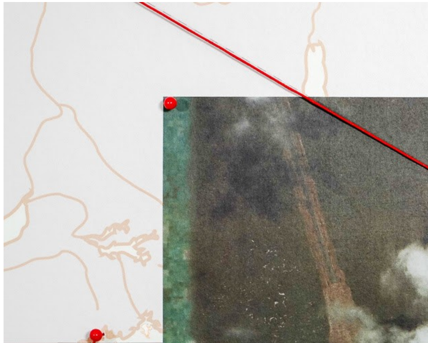
Camp Simba, Kenya

(SIPRI) shows that there are 23 active armed conflicts on the African continent (Angola, Burkina Faso, Burundi, Cameroon, the Central African Republic, Chad, Côte d'Ivoire, the Democratic Republic of the Congo, Egypt, Ethiopia, Guinea, Kenya, Libya, Madagascar, Mali, Mozambique, Niger, Nigeria, Somalia, South Sudan, Sudan, Uganda, and Western Sahara). With a 41% net increase in fatalities from 2019-2020, SIPRI writes, sub-Saharan Africa 'was the region with the most conflict-related fatalities in 2020'. It is well-worth recalling that US and French arms manufacturers, whose combined arms exports accounted for over 43% of the global total between 2015 and 2019, provide the lion's share of weapons for these conflicts.