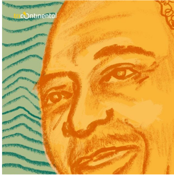
Kofi Awoonor, 1935-2013

In 2013, when extremists from al-Shabaab attacked the Westgate Shopping Mall in Nairobi (Kenya), they shot and killed Kofi Awoonor, a Ghanaian poet, ambassador to Cuba, Brazil, and the UN, and chair of a UN committee against apartheid. Awoonor would often talk of the ‘distresses’ of his country – the same country that President Kwame Nkrumah led out of colonialism and into a new possible future. Military coups and IMF austerity deadened the hopes of generations of Ghanaians in their struggle for liberation, but Awoonor held fast. One of my favourite poems by Awoonor is ‘The Cathedral’, which carries forward that sense of the ‘distresses’ that are visited upon our world and that continue to be fought against today: