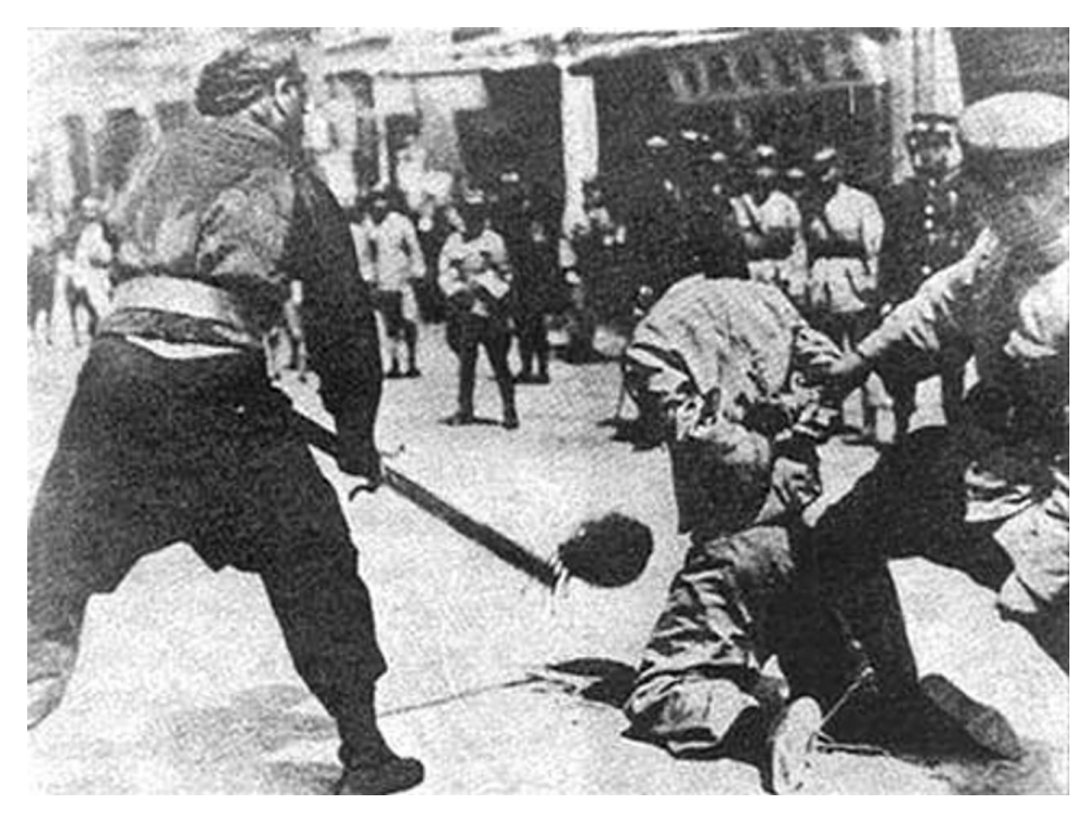
One of Chiang's thugs executing a communist worker in 1927

The revolutionary struggle against imperialism does not weaken, but rather strengthens the political differentiation of the classes... To really arouse the workers and peasants against imperialism is possible only by connecting their basic and most profound life interests with the cause of the country's liberation... But everything that brings the oppressed and exploited masses of the toilers to their feet inevitably pushes the national bourgeoisie into an open bloc with the imperialists. The class struggle between the bourgeoisie and the masses of workers and peasants is not weakened, but, on the contrary, is sharpened by imperialist oppression, to the point of bloody civil war at every serious conflict.