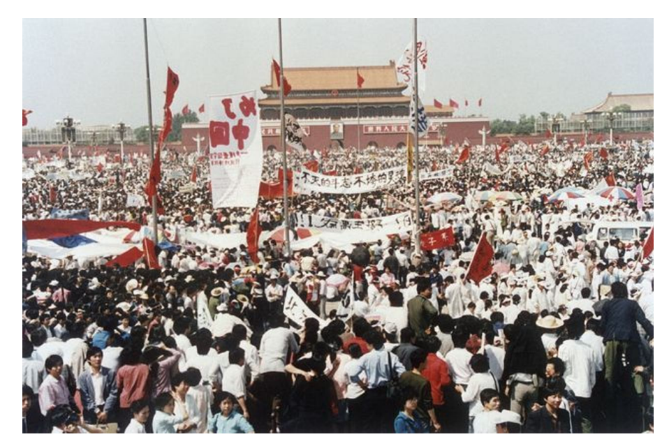
Mass protest in Tiananmen Square in May 1989

joblessness, and soaring inflation that led to the national wave of protests and strikes in 1989. Deng's brutal suppression of the protests, not only in Tiananmen Square but in cities throughout China, opened the door for a flood of foreign investors, who understood that the CCP could be relied on to police the working class.