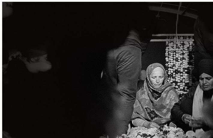
Women decorate a palki sahib , a Sikh religious structure at the Singhu border in Delhi, 31 December 2020.

This inequality has only gotten worse during the pandemic. Between March and October 2020, Mukesh Ambani, India's richest man, saw his wealth double to $78.3 billion, making him the sixth richest person in the world. In four days, Ambani made more than the total wages of his 195,000 employees. During this period, Modi's government allocated a mere 0.8-1.2% of the GDP to its population for relief. The farmers and their families respond to this naked class warfare with the formation of their unyielding Kisan Commune.