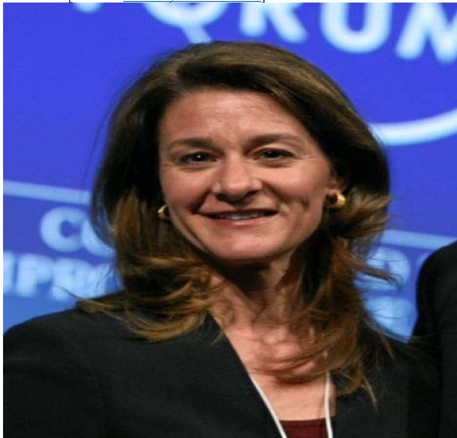
• Melinda Gates

We do not know if they were influenced by Elliott Abrams's appeal, but the anti-Sandinista message was likely heard one way or another. Land disputes involving indigenous groups are widespread in the Americas, including North America. Research and reports could be done regarding almost every country. But instead of researching and reporting on indigenous land conflicts in Colombia or Honduras or British Columbia, the billionaire foundations chose to fund reports on Nicaragua.