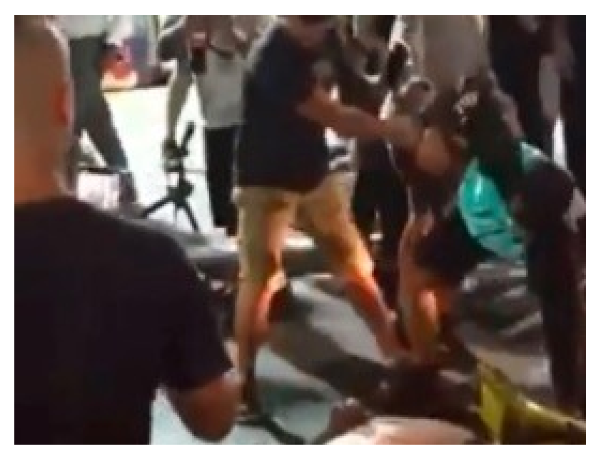
A Muslim Israeli is lynched by Jewish Israelis in Lod, live on television.

The U.S. has made repeated contacts with Israel to call for de-escalation, to no avail. It appears that since Washington is preparing to formally re-engage with Iran - after the election of its next president and the signing of a new nuclear agreement - against Tel Aviv's advice, it will not exert more pressure on Israel. Hoping to achieve something, however, the United States opposed a third Security Council meeting by teleconference in order to give it time. Under the rules of the Council, the rotating presidency, this month China, has the power to impose a face-to-face meeting, but Beijing abstained.