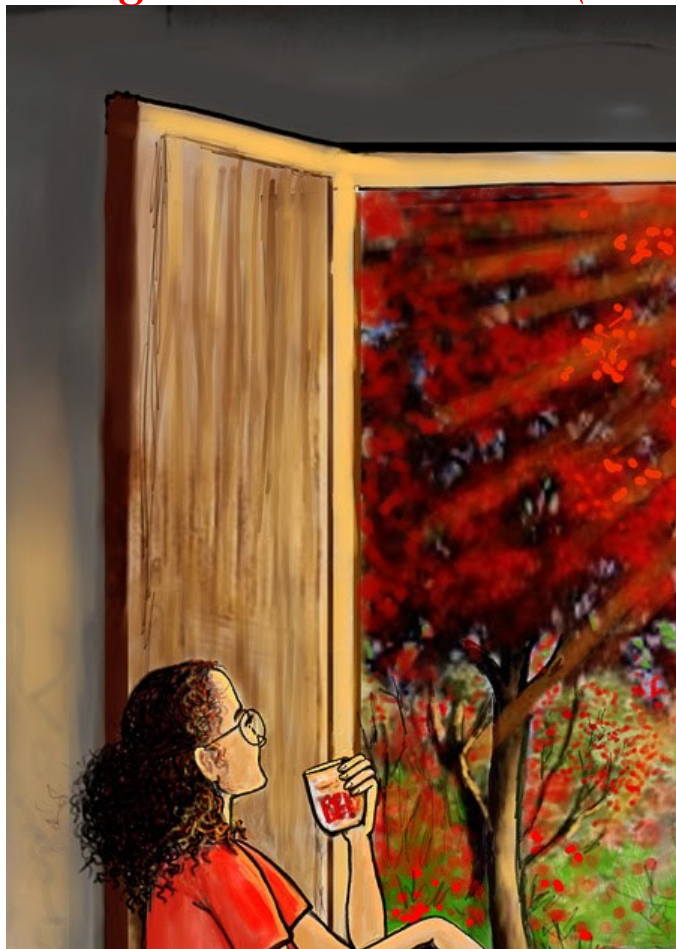
E. Meera (Kerala), Red Dawn , 2021.