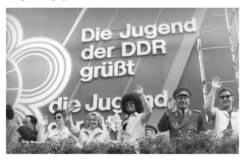
The Free German Youth, a member of the World Federation of Democratic Youth, hosted the Tenth World Festival of Youth and Students in Berlin, 1973.

The memory of this solidarity no longer remains either in Germany or in South Africa. Without the material support provided by the DDR, the USSR, and Cuba, it is unlikely that national liberation in South Africa would have come when it did. Cuban military support for the national liberation fighters at the 1987 Battle of Cuito Cuanavale was crucial for this defeat of the South African apartheid army, leading eventually to the collapse of the apartheid project in 1994.