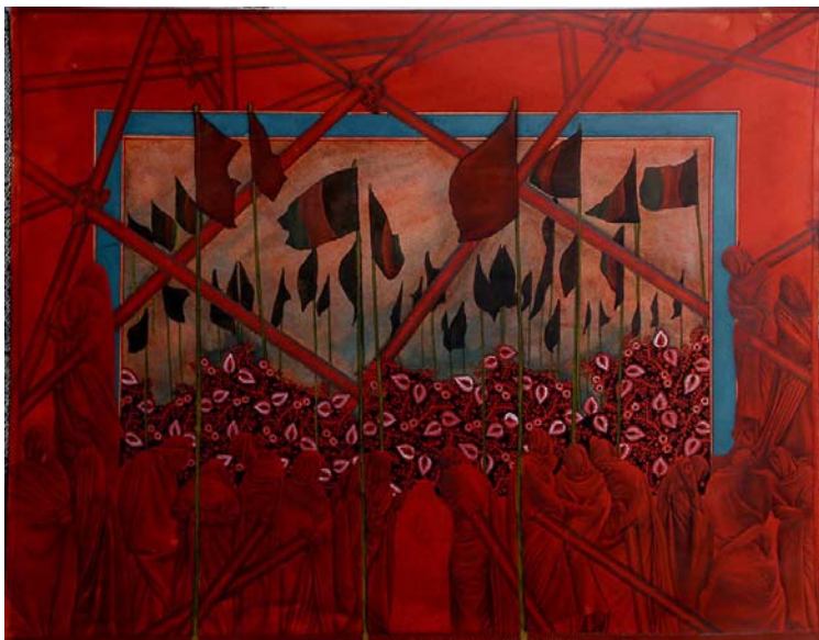
Mohsen Taasha Wahidi (Afghanistan), Rebirth of the Red , 2017.