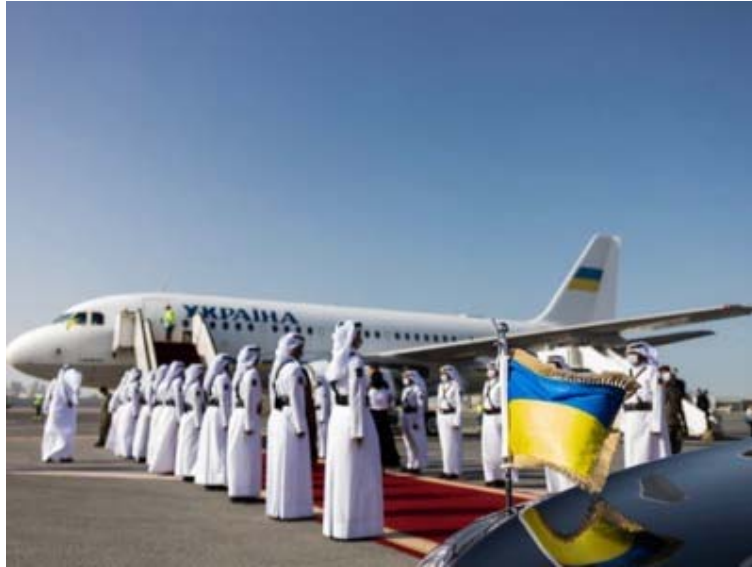
Discreet return trip to Qatar by President Zelensky and the head of the Ukroboronprom arms factories on April 5, 2021.