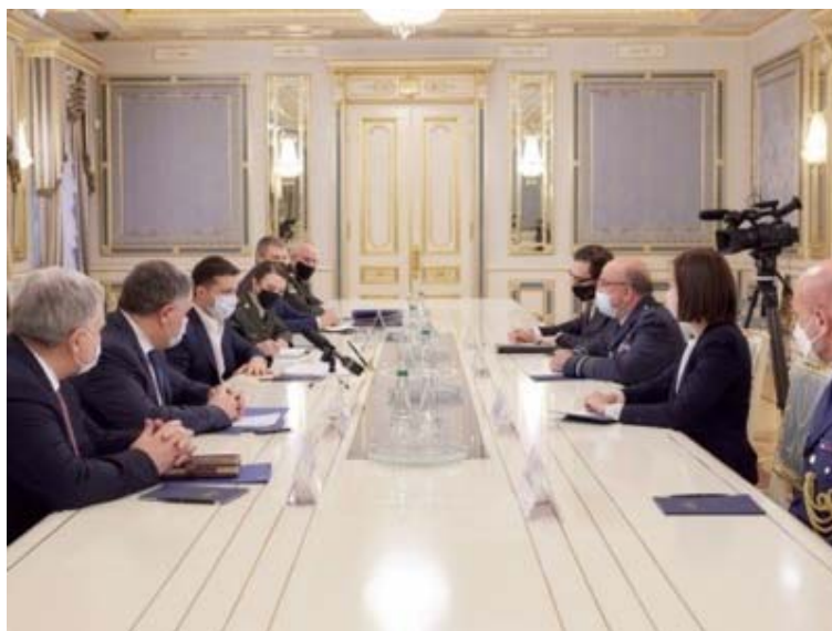
President Zelensky receives the Chairman of the Nato Military Committee on April 7, 2021.

On April 6, Lithuania, which in the past protected the western part of Ukraine in its own empire, enquired about the military situation [16] .