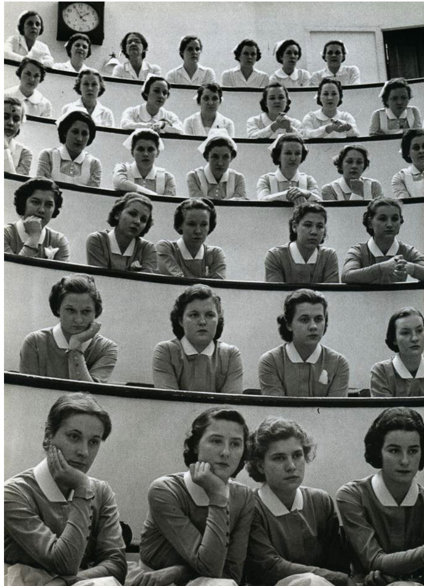
Alfred Eisenstaedt (USA), Student Nurses at Roosevelt Hospital (1938).

Covaxin, the vaccine developed by Bharat in India). But there are problems here since it is not always easy to inactivate the harmful pathogen whilst still keeping it whole to develop the antibodies.