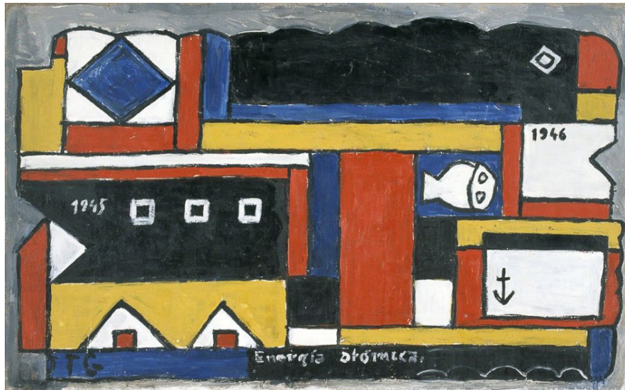
Joaquín Torres García (Uruguay), Energía Atómica (Atomic Energy) , 1946.

have been made for specific strengths and limitations. Both Big Pharma and the countries of the North suffocated this proposal.