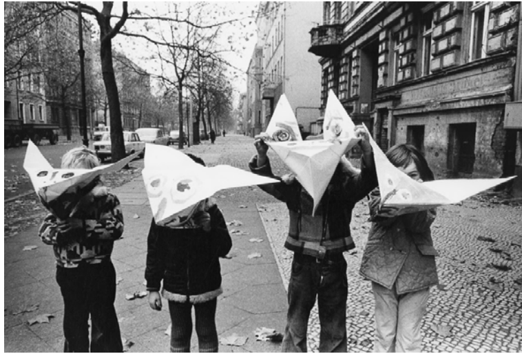
Roger Melis (DDR), Kinder in der Kollwitzstraße ('Children in Kollwitzstraße'), 1974.

genetic changes in the infectious microbe can make vaccines ineffective and necessitate development and deployment of new vaccines.