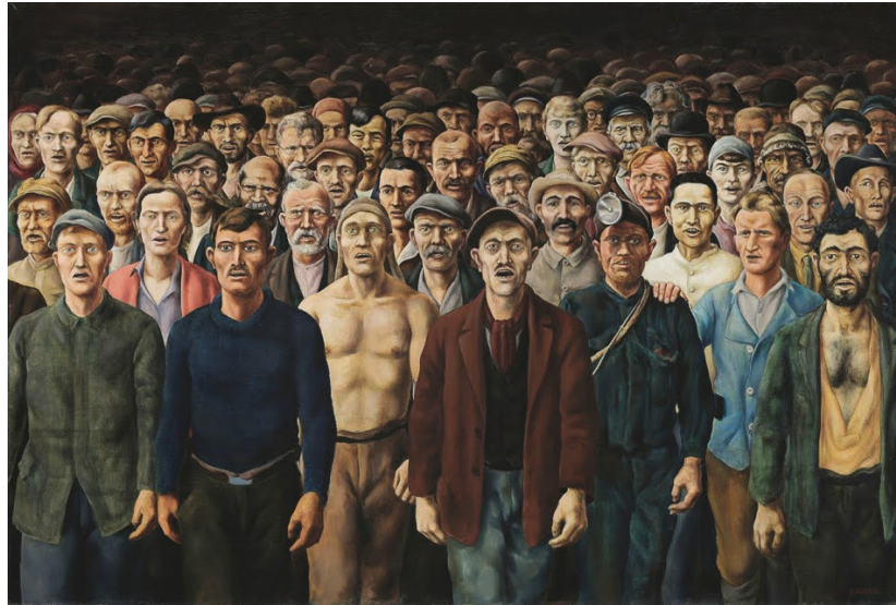
Otto Griebel (Germany), The Internationale, 1929/30.

gets harder to deal with everyday life, then anger will rise, and a general social misery will come out on display.