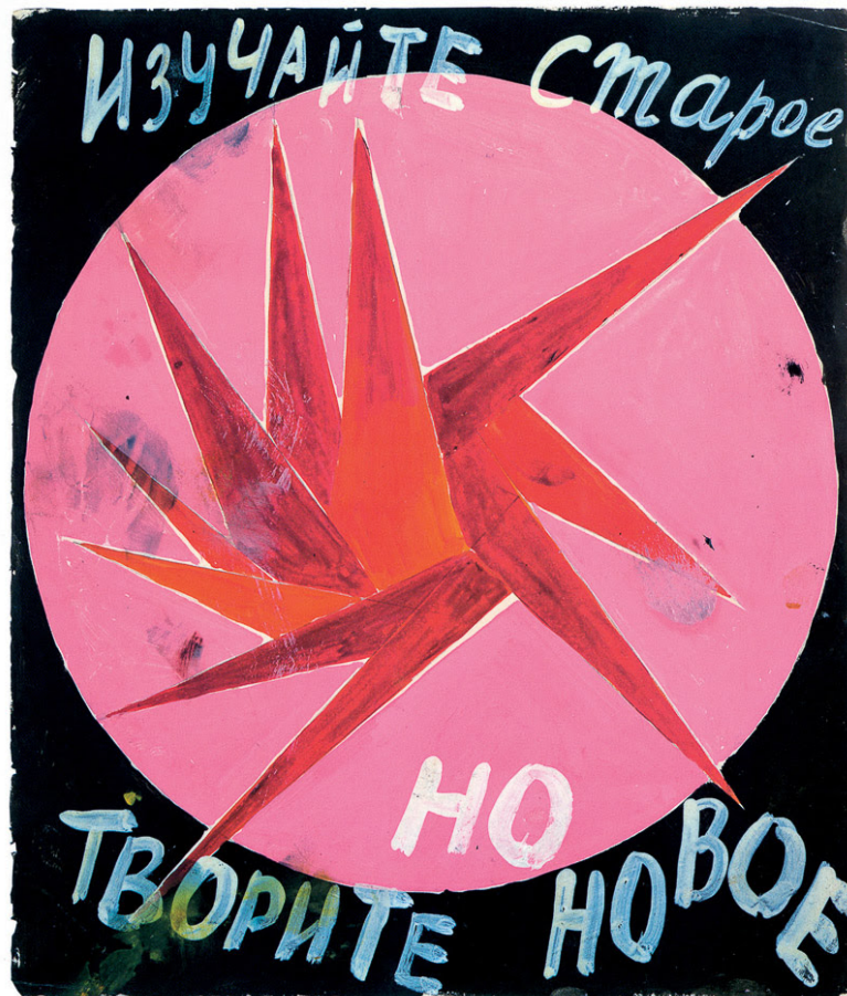
Varvara Stepanova (USSR), Study the Old, but Create the New , 1919.

local social and cultural organisation La Chimba. From the mayor's office, Jadue created a municipal pharmacy, optical shop, bookstore and record store, an open university, and a real estate project that operates free of the profit motive. 'I have dreamt of this plan all my life', Jadue tells me.