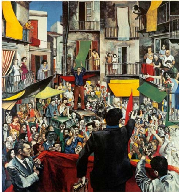
Renato Guttuso (Italy), Comizio di quartiere , 1975.