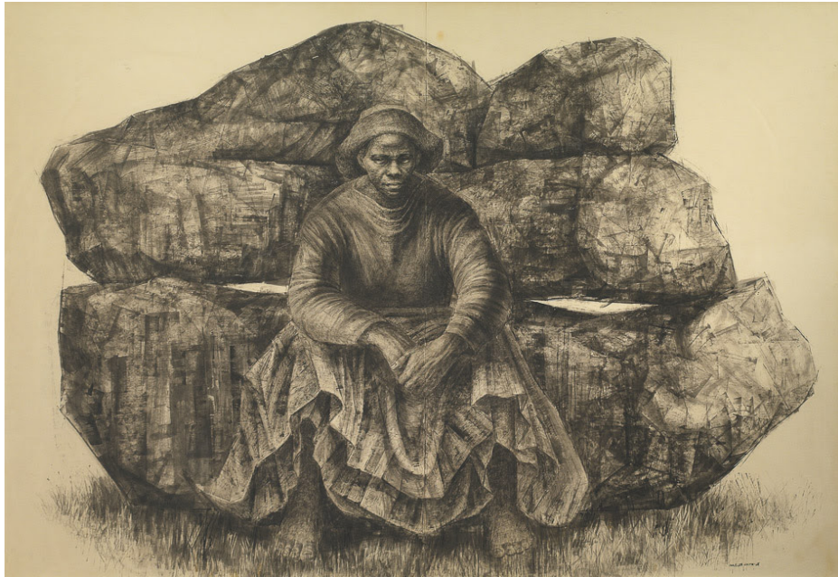
Charles White (USA), General Moses (Harriet Tubman) , 1965.

they are not interested in the well-being of the people', Jadue tells me. 'Capitalism', Jadue says, 'creates the poor', and the poor then come to ask for goods and services from the state due to their relative powerlessness. 'The poor are more honest than the rich. If the poor can buy goods and services at a just price, then they don't ask for money'.